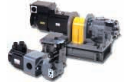
Direct Drive Pump

Also, in the best interests of the shareholders, the Group will continue to work towards widening the revenue base. Marketing efforts in the promotion of industrial environmental protection related products will continue. The Group has promoted the "Direct Drive Pump", which can save 80% of the electricity consumed by industrial machines. With an increase in public awareness regarding environmental protection, the management believes that such energy saving devices will be well received by customers.