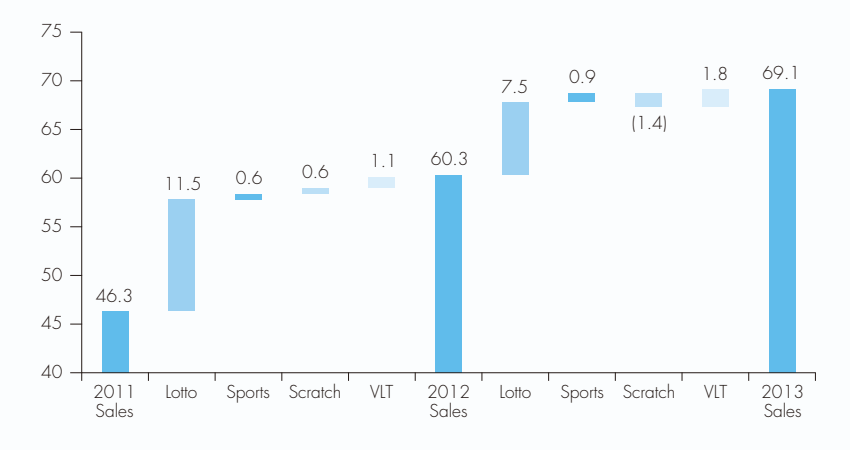
China Lottery Sales Bridge Q1 2011-Q1 2013 (RMB billion)