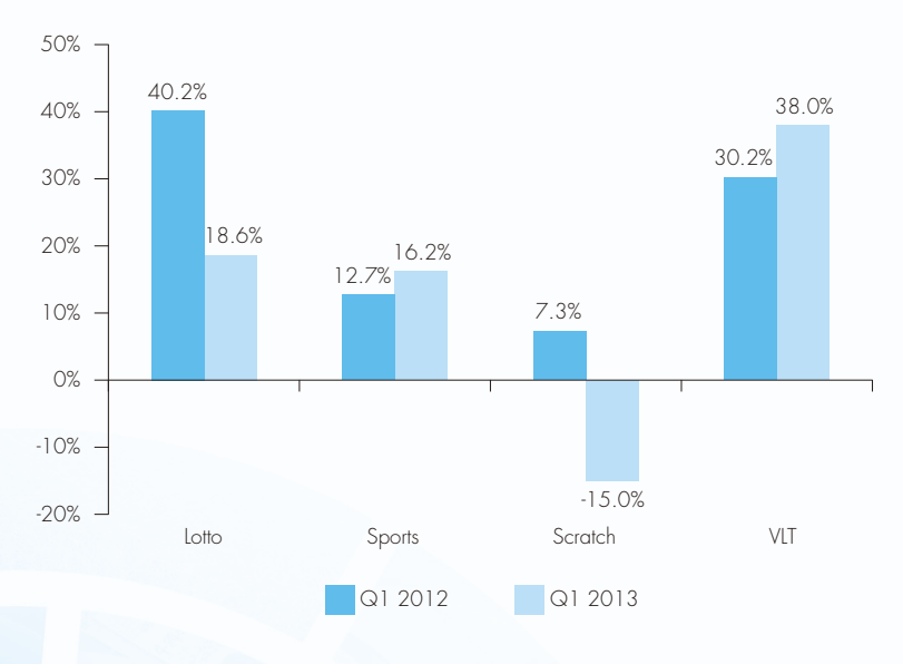
China Lottery Sales Growth Comparison by Product (Q1 2013 vs. Q1 2012)