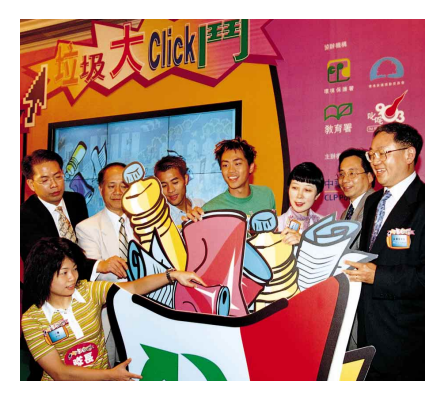
"Place the Waste On-line Challenge" award ceremony

authorities. Everything possible will be done to ensure that this never happens again. CLP has made massive efforts to promote safety in all areas of its operations. This accident was a stark reminder of the need for constant vigilance and attention to safety as we carry on our business, day after day. We are committed to continuous improvement in our safety performance and a constant drive to zero accident levels across our business.