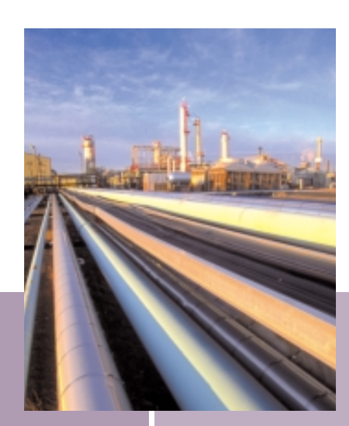
Husky's 1,900 kilometre pipeline system transports oil production from Alberta and Saskatchewan to the company's upgrading and refining operations in Lloydminster.