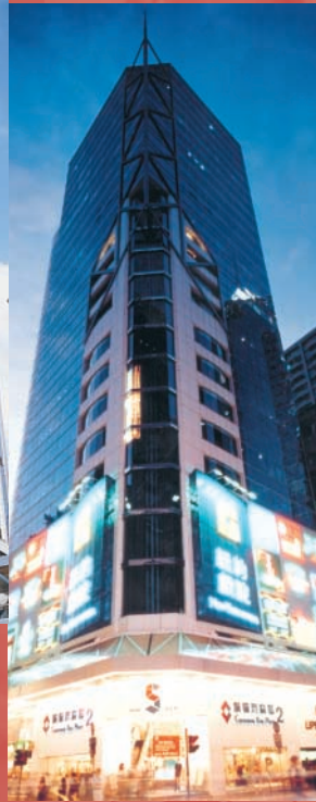
Causeway Bay Plaza 2