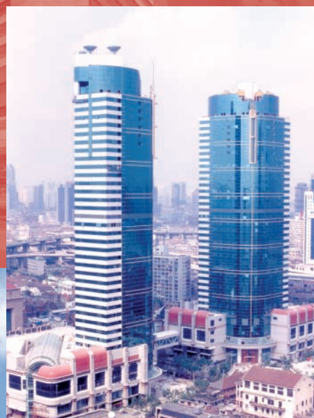
Hong Kong Plaza, Shanghai