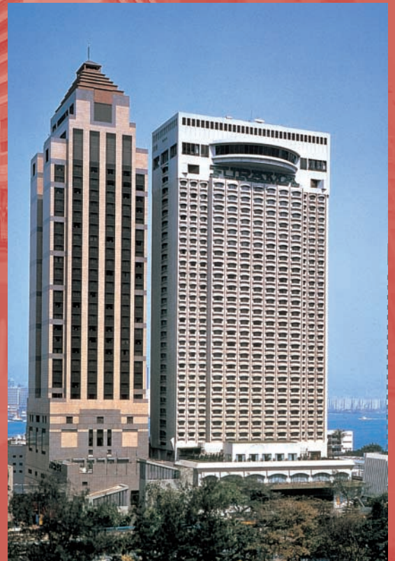
The Ritz-Carlton Hong Kong and Furama Hotel Hong Kong