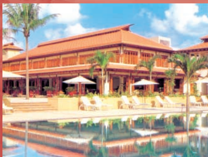
Furama Resort Danang