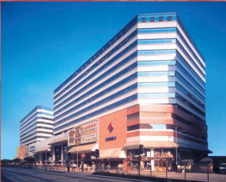
Cheung Sha Wan Plaza