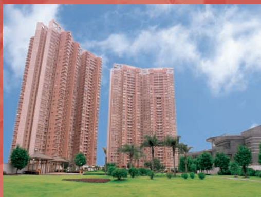
Eastern Place, Guangzhou