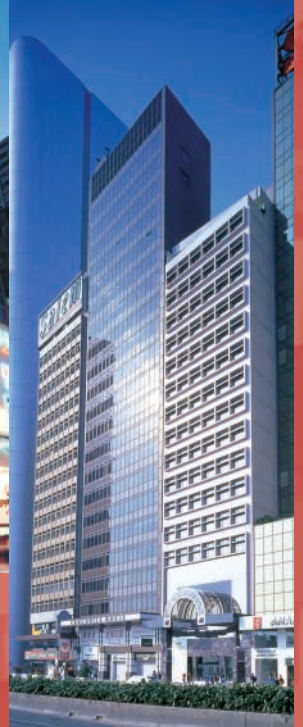
Crocodile House 1 & 2