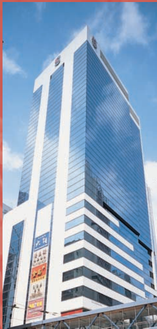
Causeway Bay Plaza 1