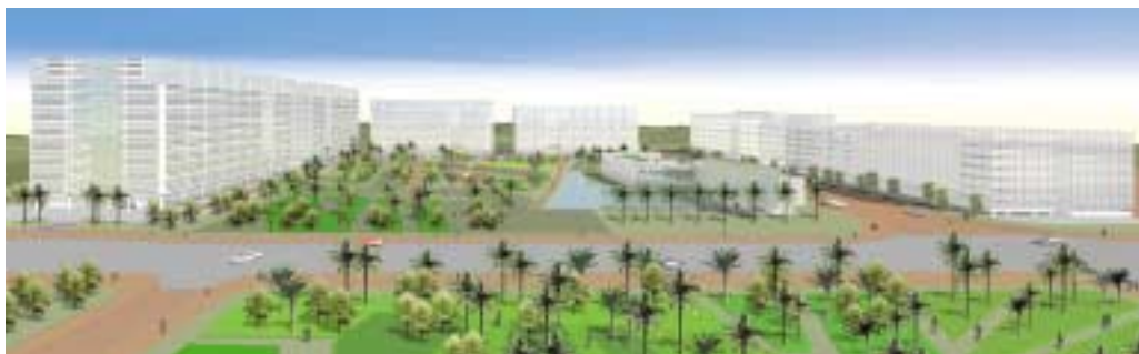
Artist's impression of Vision (Shenzhen) Business Park Phase 2 Development

Vision (Shenzhen) Business Park is the Company's first business park project in China. Located in the south zone of the Shenzhen Hi-Tech Industrial Park ("SHIP") on a prime site spanning 33.8 hectares of land, Vision (Shenzhen) Business Park has a planned gross floor area of some 600,000 sqm and is scheduled to be completed in three phases.