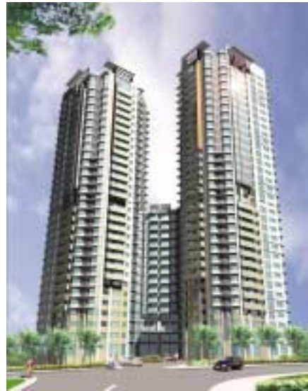
Artist's impression of Vista Place, Dalian

Vista Place is a condominium development situated in Zhongshan District, which is the central business district of Dalian. It has a total gross floor area of approximately 60,000 sqm. Construction is expected to commence in the first quarter of 2002.