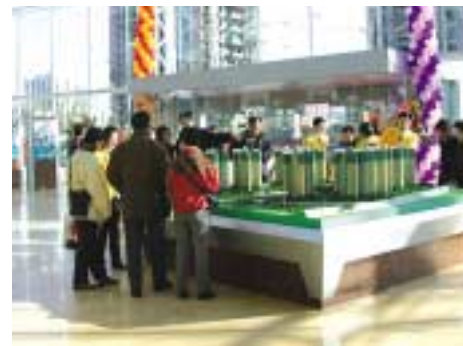
At the sales office of Scenic Place, Beijing

The first phase, which is anticipated to be completed in 2002, will have 3 blocks of residential towers consisting of 788 units with flat sizes ranging from 70 to 147 sqm. Its luxurious clubhouse covers a total gross floor area of approximately 3,000 sqm. and will provide full recreational facilities such as indoor-heated swimming pool, billiards room, karaoke rooms, sauna room, children's playroom, computer room, tennis courts, library, gymnasium and an open cafe.