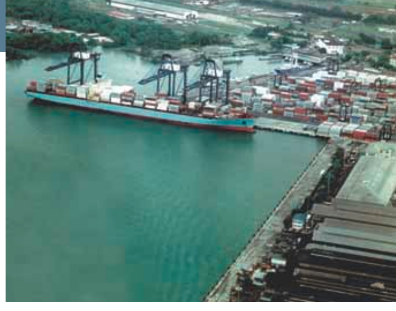
The Port of Balboa serves the trans-Pacific trades.