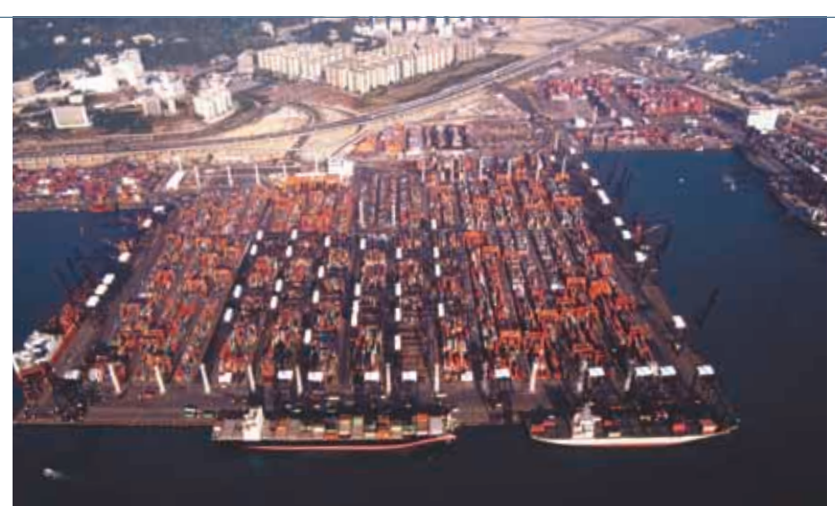
HIT and COSCO-HIT terminals handle over 50% of Kwai Chung Container Port's throughput.

Other operations in Hong Kong include the mid-stream and river trade businesses. Mid-Stream Holdings had a satisfactory year handling more than 1.4 million TEUs, an 11% increase, although EBIT was below last year. The River Trade Terminal Company (33% interest) which principally serves the water borne trade between the Pearl River Delta region and Hong Kong, continued to incur losses.