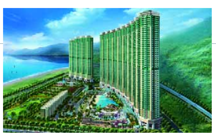
Caribbean Coast is situated in the picturesque Tung Chung new urban centre, close to the Hong Kong International Airport in Chek Lap Kok.