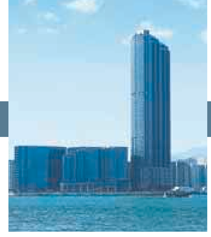
An imposing 72 storey development on the Hunghom waterfront, The Harbourfront Landmark is the highest waterfront residential building in Hong Kong.