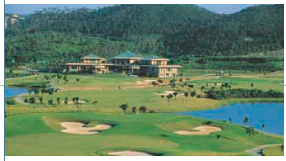
Dongguan Harbour Plaza Golf Club boasts 27 championship holes covering a total site area of 14 million sq ft.

Adjacent to the 27 hole Harbour Plaza Golf Club, in which the Group has a 42% interest, the Group has a 47.3% interest in a 3.4 million sq ft development near Houjie, Dongguan. The next phase of this multiphase deluxe residential housing development, The Lakeside, consists of 864,000 sq ft and is due for completion in 2003. Presale activity has recently commenced.