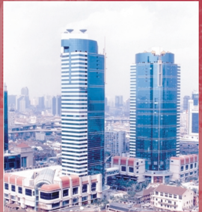
Hong Kong Plaza, Shanghai