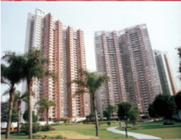
Eastern Place, Guangzhou