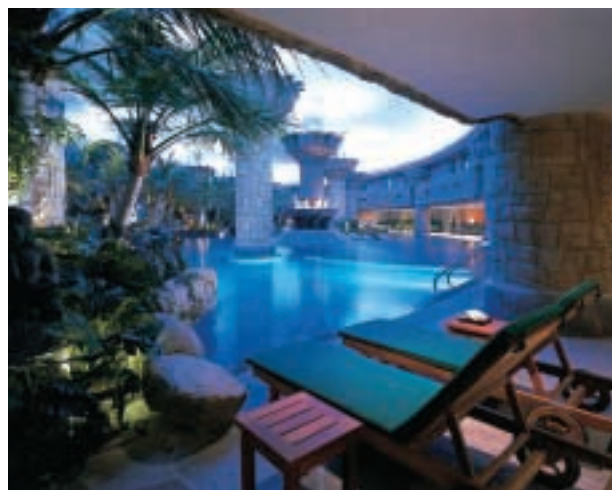
Set against a lush tropical landscape, the magnificent resort-style indoor pool in Beijing Oriental Plaza features a "virtual sky" with over 20 special effects that mirror natural weather conditions.