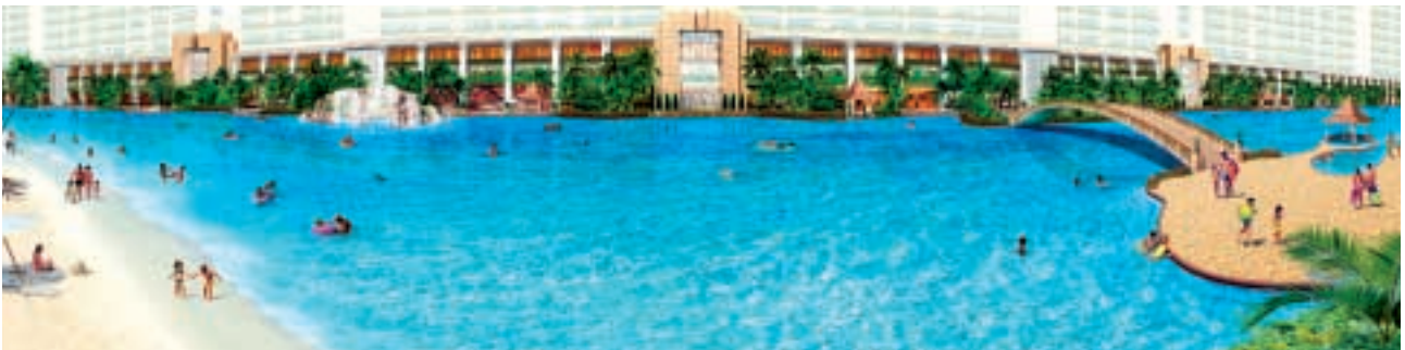
■ At 200 metres, the leisure swimming pool at Rambler Crest is the longest in Hong Kong.