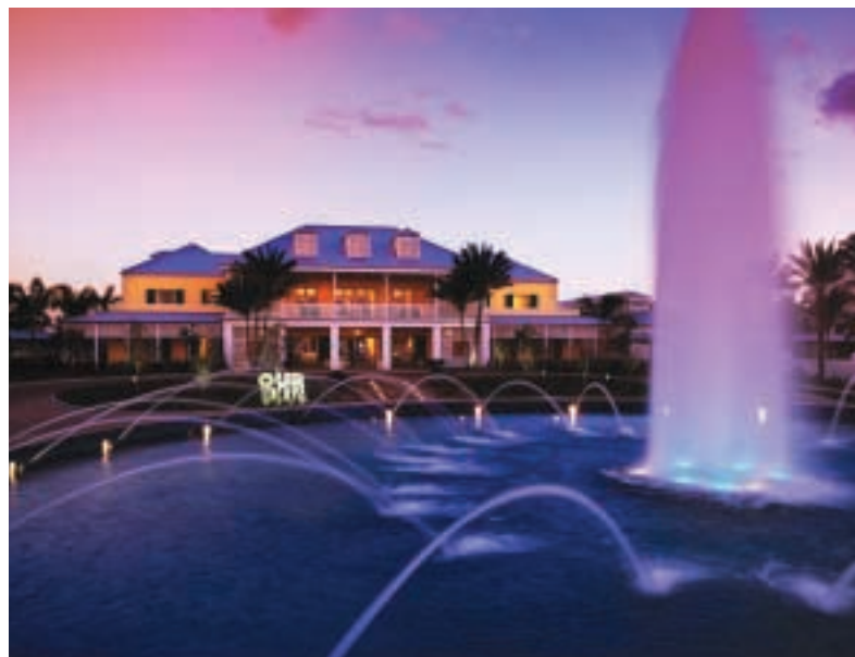
■ The grand entrance and the main lobby (Manor House) of The Westin and Sheraton at Our Lucaya Beach & Golf Resort - Grand Bahama Island.