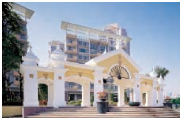
The main entrance of Parc Barcelona at Le Parc Phase II in Shenzhen reflects the classic style of Spanish architecture.

During the year, profits were recorded from the completion and sale of 1,362 residential units in Rambler Crest, Hong Kong, 1,494 residential units in Le Parc, Shenzhen, 358 residential units in The Summit, Shanghai, 41 residential units in Regency Park in Shanghai and 171 residential units in Albion Riverside, London.