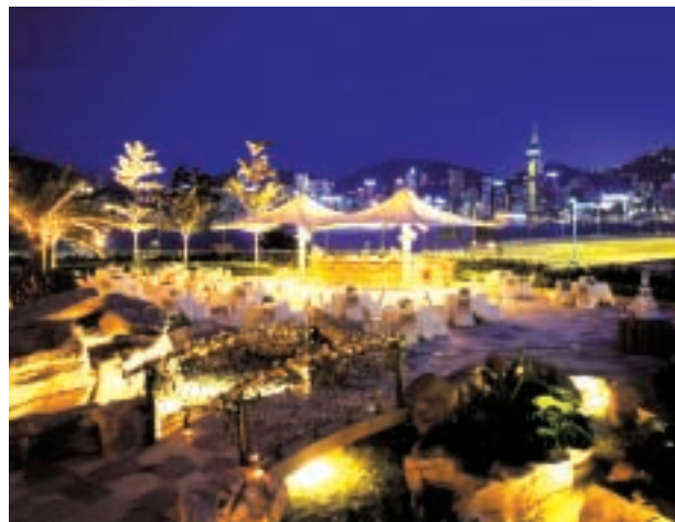
The world famous night view of Victoria Harbour makes dining at Harbour Plaza Metropolis an unparalleled experience.

The Westin and Sheraton at Our Lucaya Beach & Golf Resort on Grand Bahama Island reported an improved result with LBIT 30% lower than last year despite the low levels of leisure travel from the USA due to ongoing security concerns.