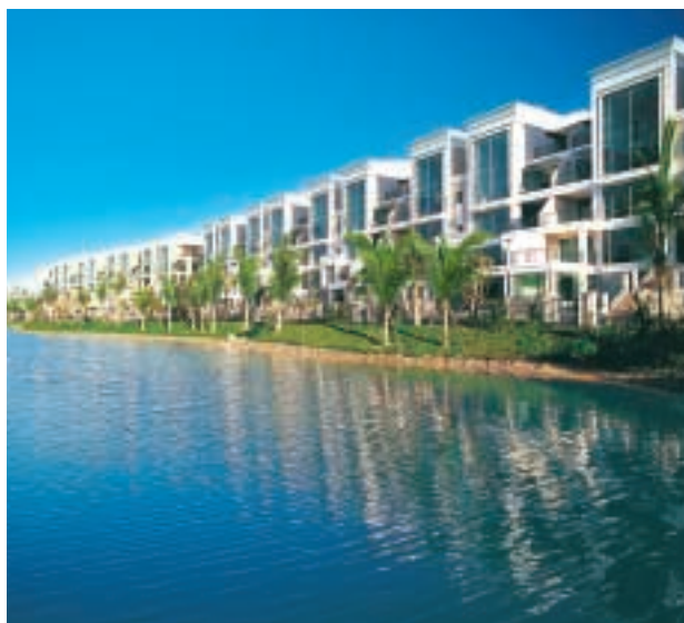
■ Serenity is taken for granted in Zhuhai Horizon Cove, overlooking the tranquil 30,000-square-metre man-made lake.

The last phase of Seasons Villas in Shanghai, a low-density residential project, will be completed this year. Most of the units have been retained for leasing. Pre-sale activity for Dynasty Garden in Baoan, Shenzhen commenced during the year and 24% of the residential units were pre-sold. The project is scheduled to be completed later this year. The final phases of Regency Park, the second phase of Beverly Hills, the remaining tower of serviced apartments of Beijing Oriental Plaza as well as The Center are scheduled for completion this year, generating development profits and increasing the portfolio of investment properties of the Group. The other projects under development are progressing well.