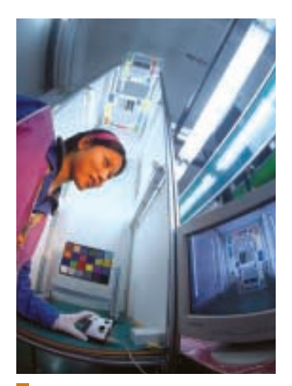
An HHR quality check staff member tests the final assembly of digital cameras to ensure the accurate focusing calibration.