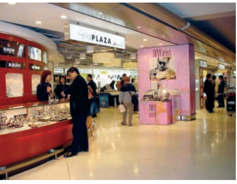
Located in the East Hall of Hong Kong International Airport, The Plaza is the largest store under Nuance-Watson (HK)'s shop portfolio.

Nuance-Watson, a 50% joint venture with Nuance International Holdings, holds retail concessions at the Hong Kong International Airport and at the Singapore Changi Airport. Combined sales decreased whilst EBIT declined marginally due to the decrease in passenger numbers and spending in the first half of 2003 as a result of SARS.