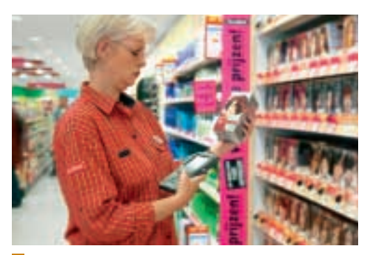
Wireless handheld terminals are widely used by Kruidvat staff to keep track of stock flow.

Hutchison Harbour Ring ("HHR"), a 61.97% owned subsidiary, is listed on the SEHK and is a leading toy manufacturer as well as a supplier and manufacturer of consumer electronic products. The company also holds a number of investment properties in the Mainland. HHR announced turnover including its share of associated companies turnover, of HK$2,208 million and profit attributable to shareholders of HK$128 million, an increase of 18% and 30% respectively, mainly due to increased sales of consumer electronics products, such as mobile handset accessories.