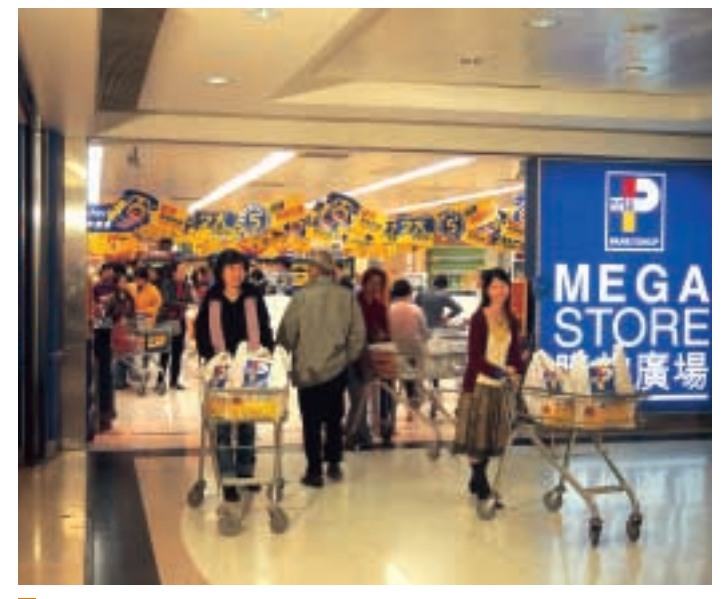
PARKnSHOP's megastore concept combines variety, value, convenience and shopping comfort for Hong Kong consumers.

The PARKnSHOP supermarket chain in Hong Kong continued to be affected by the deflationary economy and also SARS. Although it maintained its leading market share and continued to expand in new areas, its sales and EBIT were adversely affected. PARKnSHOP's operations in the Mainland continued to expand and performed well, reporting increased sales and EBIT. Three additional large format stores were opened during the year and more are planned for this year.