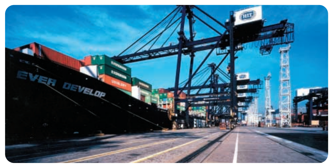
Hongkong International Terminals, the flagship of Hutchison Port Holdings, proudly retains its position as a world leader in container handling.