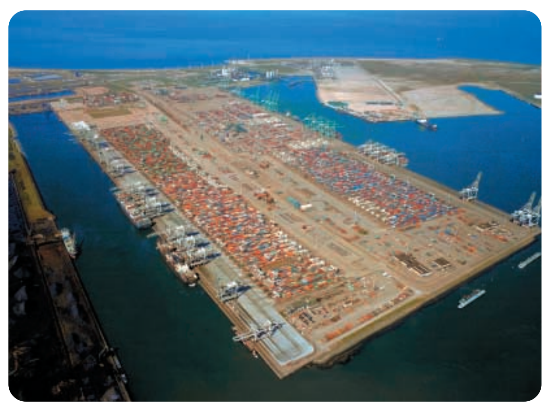
• A bird's eye view of ECT Delta Terminal in Rotterdam

In January this year, the Group acquired an 83.53% interest in Gdynia Container Terminal, a general cargo terminal in the Port of Gdynia, Poland, with a plan to develop it into a modern container terminal with three berths. The first phase of this development is scheduled for completion in the fourth quarter of 2005.