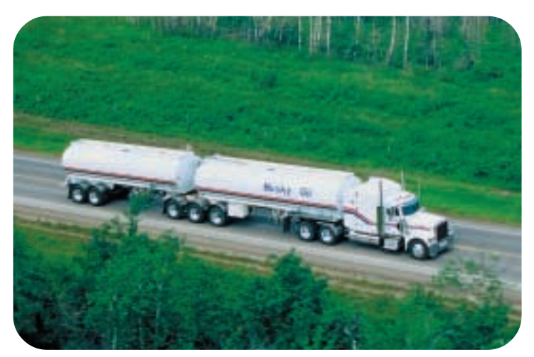
Husky brand fuel products are delivered to over 500 retail outlets and bulk distributors from British Columbia to Ontario.

The White Rose development is progressing on schedule and first oil production is expected by late 2005 or early 2006. Internationally, Husky plans to drill two exploration wells in the South China Sea in 2005 and to pursue its development in Indonesia, where it increased its interest to 100% in a production sharing contract in the Madura Strait, Indonesia.