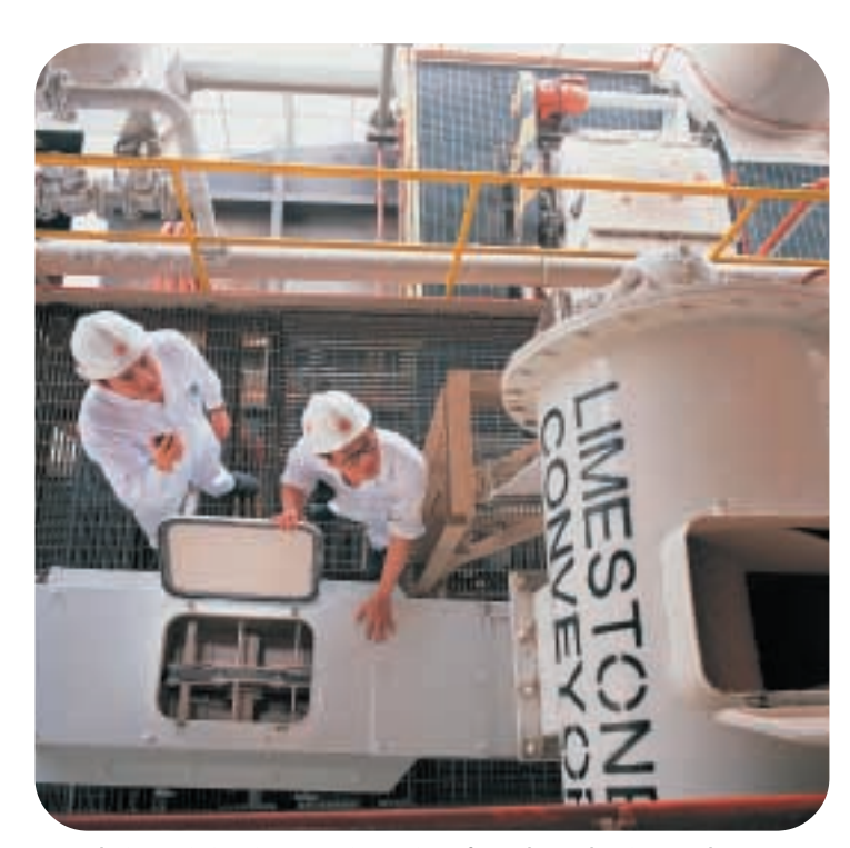
Reducing emissions is an ongoing project of Hongkong Electric. Here the desulphurisation plant "scrubs" sulphur, which reduces emissions.