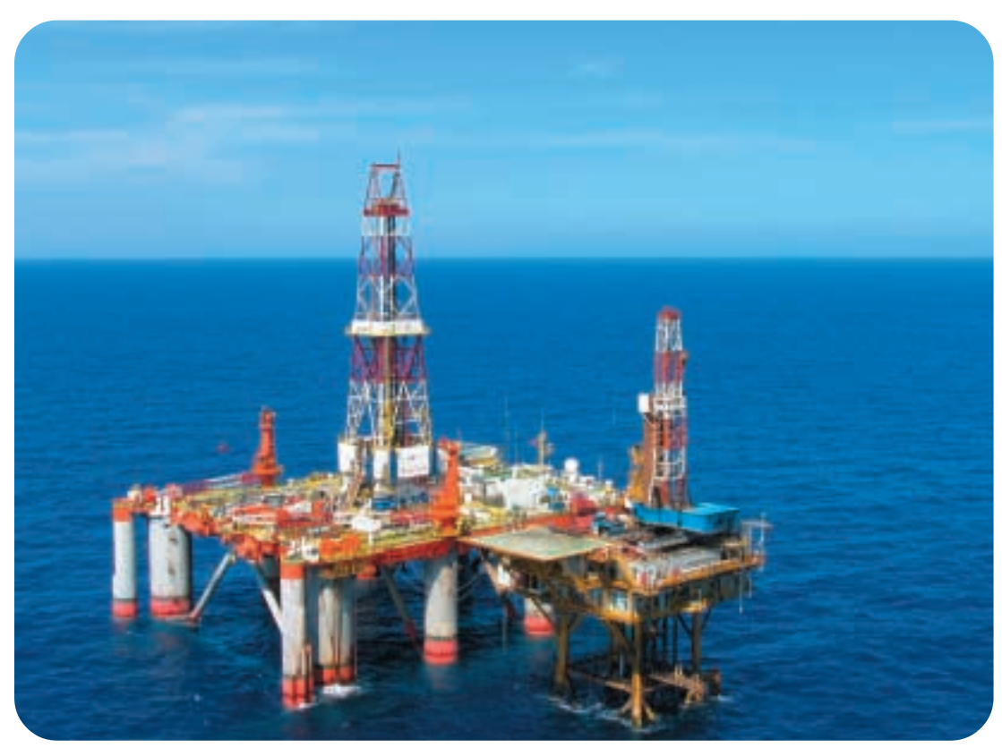
• Husky Energy has a 40% interest in the Wenchang oil field in the South China Sea.

total consideration of the project was £1,393 million (approximately HK$20,000 million). Following the announcement of the transaction, CKI divested a 19.9% interest to HEH and further disposed of 9.9% to third parties, reducing its effective direct holding to 40%. The transaction is subject to regulatory approval and is expected to be completed in mid-2005. These investments are expected to continue the earnings growth trend of CKI.