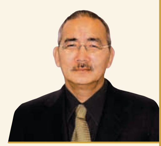
Prince Chatrichalerm YUKOL