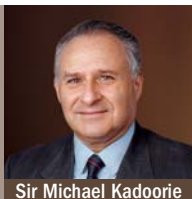
Sir Michael Kadoorie