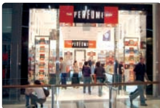
● The Perfume Shop, acquired by A S Watson in August 2005, operates over 120 stores in the UK, Ireland and Australia.

Watsons reported strong growth in both revenue and EBIT. In Southeast Asia, the Watsons operations in Singapore, Malaysia, Thailand and the Philippines all reported increased revenue and EBIT, mainly due to continued new store expansion. To further enhance its presence in Asia, in March, Watsons opened its first store in South Korea. The division also expanded its footprint to Turkey by acquiring Cosmo Shop, a seven-store health and beauty retail chain and by the opening of a Watsons store. In June, the acquisition of Apex Pharmacy, a 20-store pharmacy chain in Malaysia, was completed and rebranding of these stores to the Watsons brandname is in progress. This division currently operates more than 1,300 stores in 11 markets in Asia.