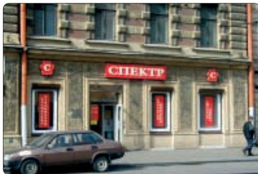
● Spektr Group, acquired by A S Watson, is an established health and beauty retail chain in St Petersburg, Russia, operating 24 stores.