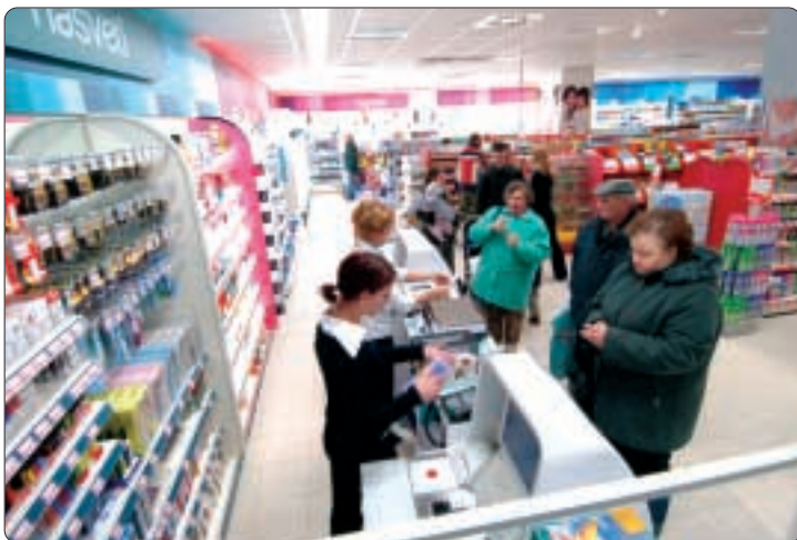
● European customers are pampered with more varieties of health and beauty products with Watsons Your Personal Store entering Europe in 2005.