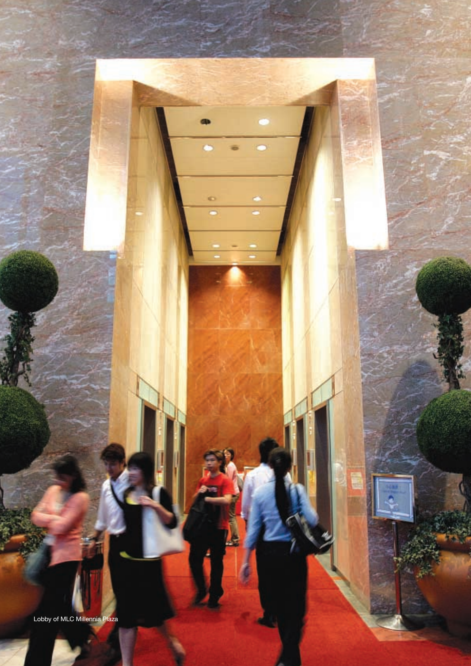
Lobby of MLC Millennia Plaza