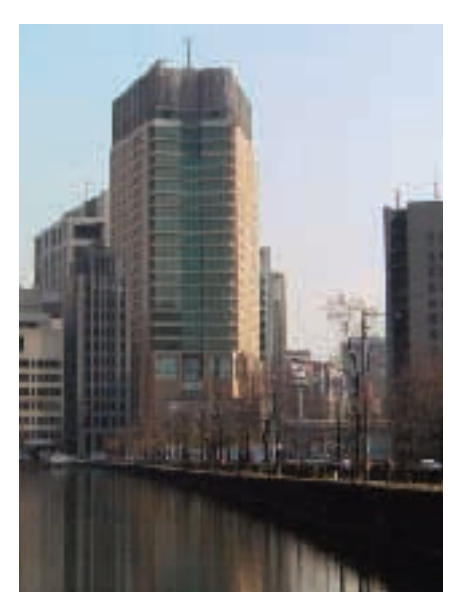
Exterior view of The Peninsula Tokyo

After nearly two years of construction, the building was topped off in June 2006 with the placement of the last construction beam. Work has continued apace on both the exterior and interior of the building.