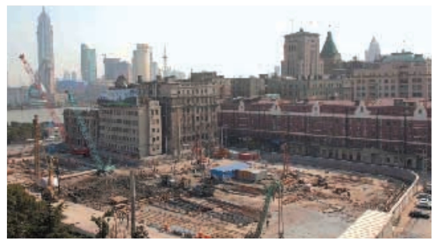
The Peninsula Shanghai's construction site