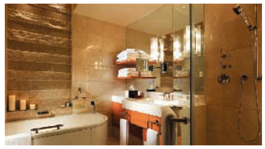
Bathroom at The Peninsula Tokyo

The Peninsula Tokyo is located in the Marunouchi district, opposite the Imperial Palace and Hibiya Park and adjacent to Ginza. It will open in the autumn of 2007.