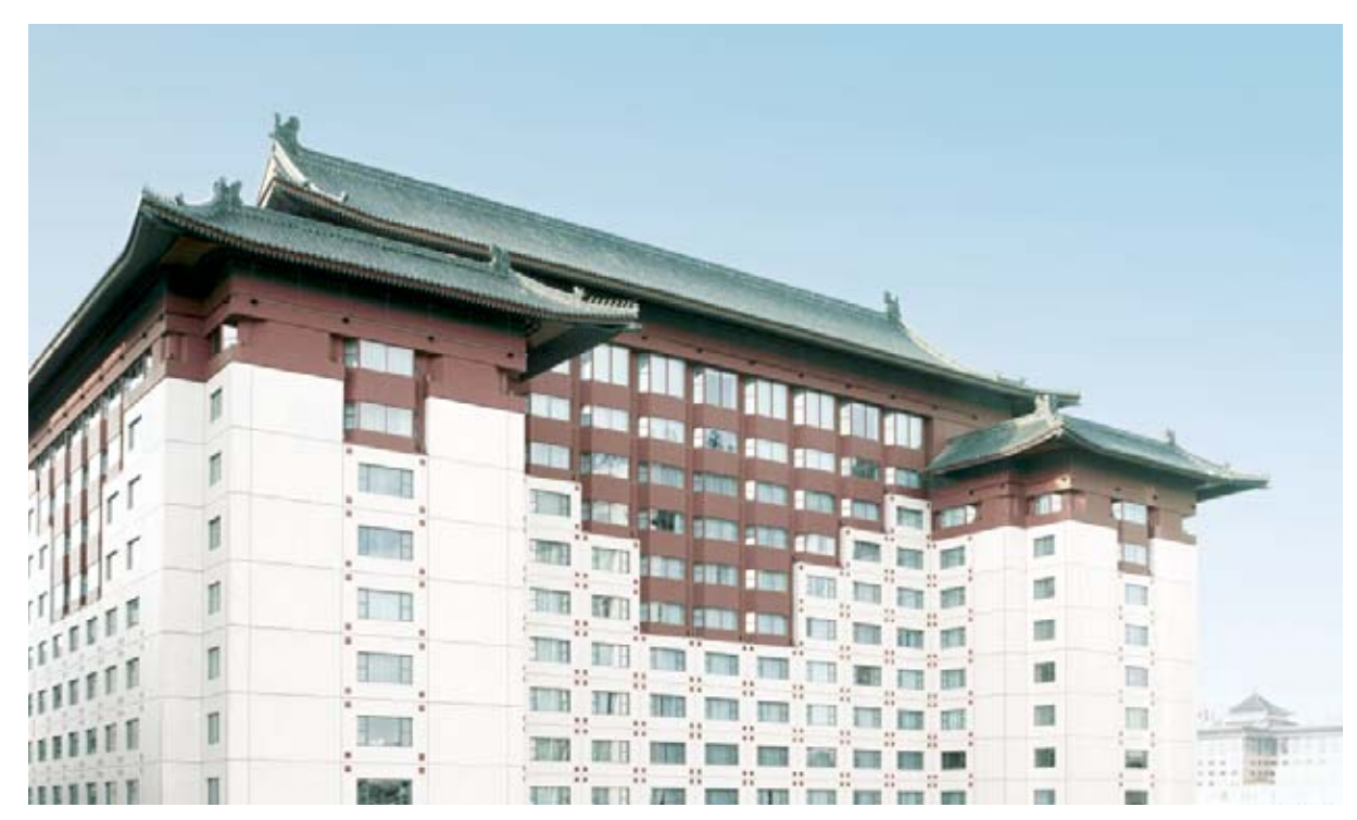
The Peninsula Beijing Hotel, Beijing 北京王府半島酒店