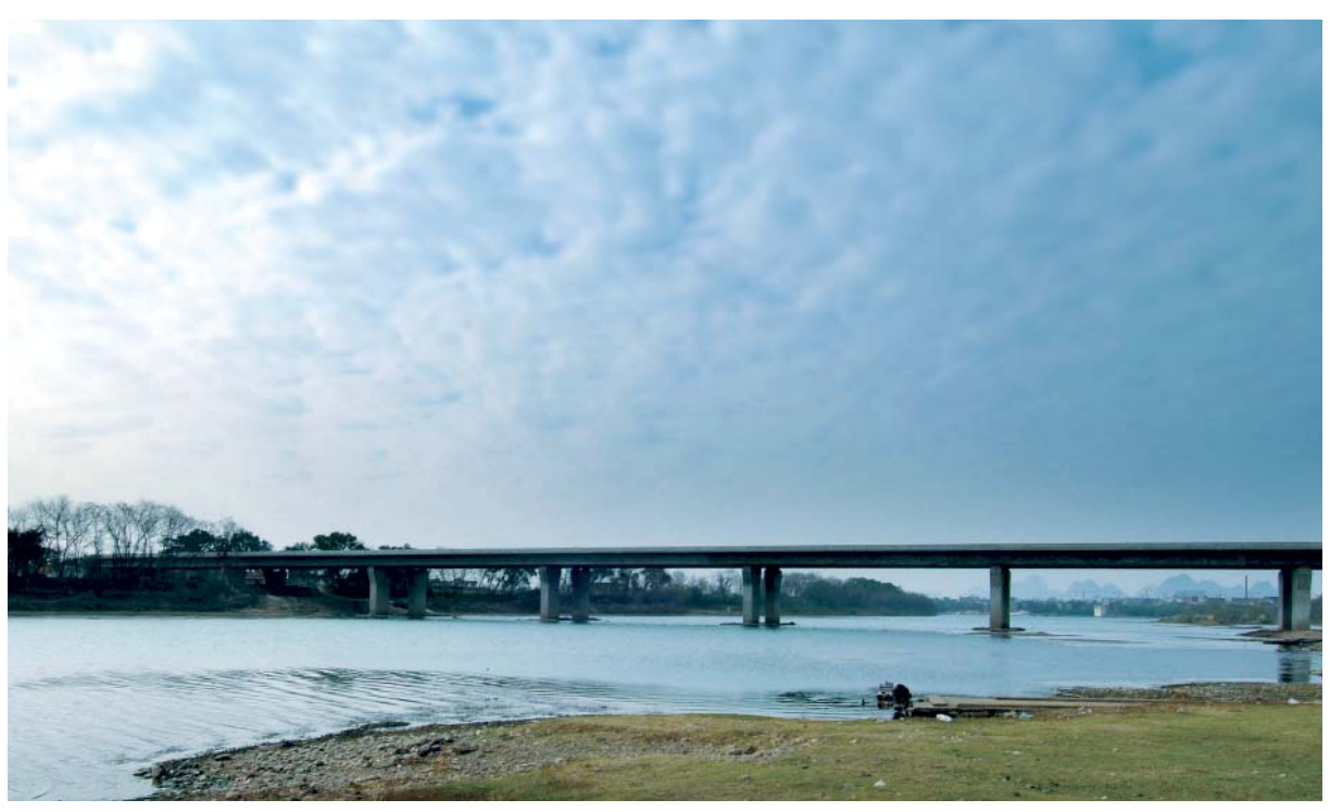
BOT Toll Road, Guilin 桂林收費道路