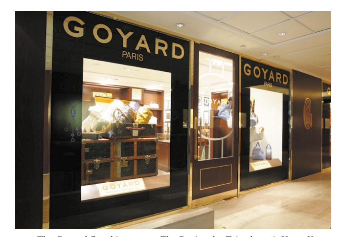
The Goyard flagship store at The Peninsula, Tsimshatsui, Hong Kong. 位於香港尖沙咀半島酒店的「Goyard」旗艦店。