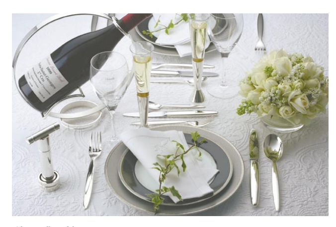
Christofle tableware. 「Christofle」餐具。