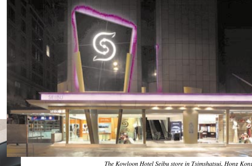
The Kowloon Hotel Seibu store in Tsimshatsui, Hong Kong. 位於香港尖沙咀九龍酒店的「西武」店。

The Group has a comprehensive retail network of 500 shops throughout the region. 本集團擁有過佈東南亞地區 之廣泛零售網絡達五百間精品店。