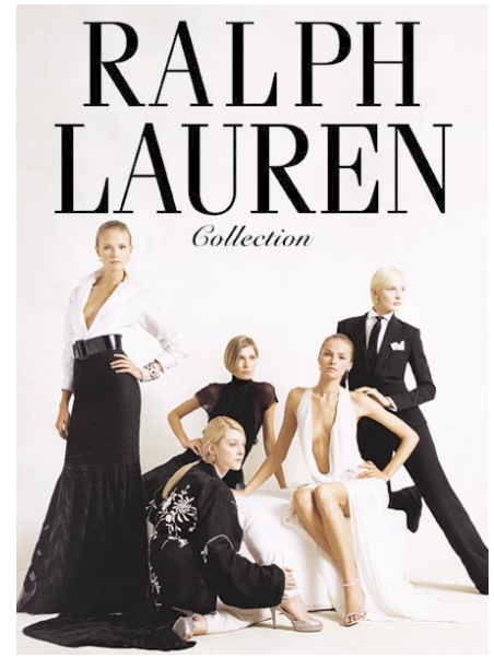
Ralph Lauren Collection ladieswear. [Ralph Lauren Collection]女士服裝。

With a proven track record of over 15 years of successful operations in Singapore, Malaysia and the Philippines, the Group's 34 shops in these countries ensure that the Group will achieve increases in sales and profits as economic conditions continue to improve.