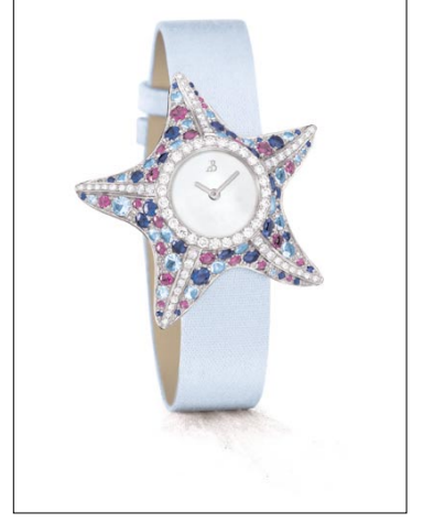
Bertolucci 'Stella' watch. 「Bertolucci」的「Stella」系列手錶。