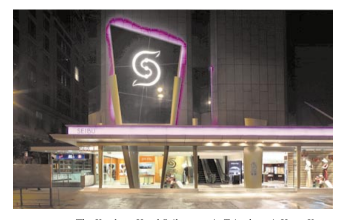
The Kowloon Hotel Seibu store in Tsimshatsui, Hong Kong. 位於香港尖沙咀九龍酒店的「西武」店。