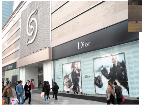
The Seibu store in Chengdu, Sichuan Province, China. 位於中國四川省成都市的「西武」店。