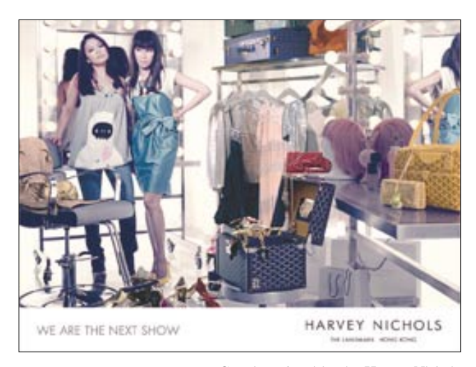
Creative advertising by Harvey Nichols. 「夏菲尼高」的創意廣告設計。