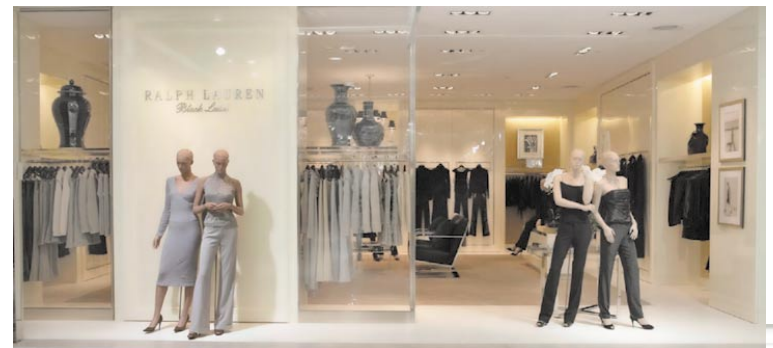
The Ralph Lauren Black Label women's shop at SOGO BR4, Taipei, Taiwan. 位於台灣台北市崇光BR4的「Ralph Lauren」 「Black Label」女士服裝精品店。