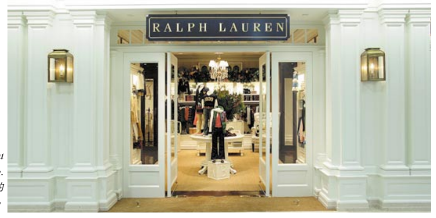
Newly renovated Ralph Lauren shop at Ocean Terminal, Tsimshatsui, Hong Kong. 位於香港尖沙咀海運大廈新裝修的「Ralph Lauren」精品店。