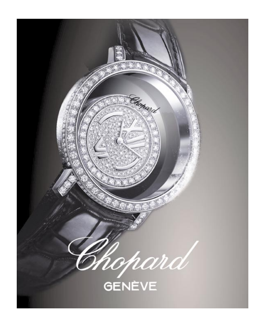
Luxury watch by Chopard. 「蕭邦」的名貴手錶。