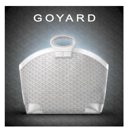
Limited edition metallic 'Beluga' handbag by Goyard. [Goyard]的限量版金屬型[Beluga]手袋。