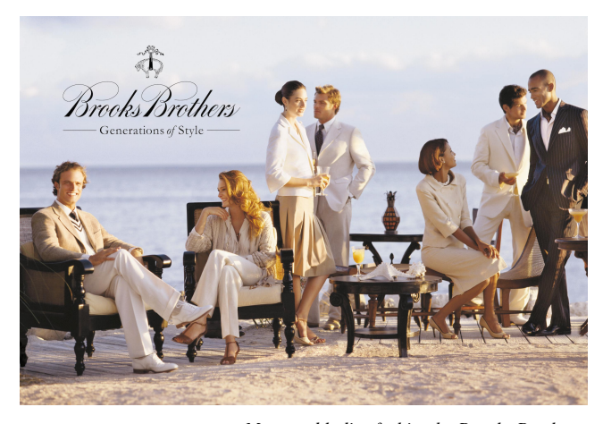
Mens and ladies fashion by Brooks Brothers. 「Brooks Brothers」的男士及女士時裝。