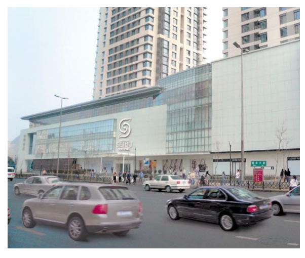
The Seibu store in Shenyang, Liaoning Province, China. 位於中國遼寧省瀋陽市的「西武」店。