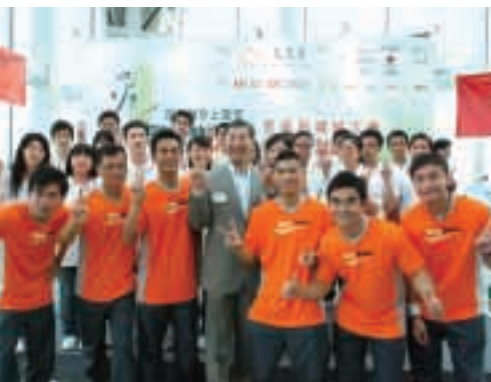
Every year, the Group not only offers Central Plaza as the venue of the Charitable Hong Chi Climbathon, but also send a corporate relay team to participate in the run.