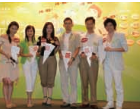
In a bid to encourage people to cherish food, Olympian City became the first shopping mall to support the 'Less Rice Save $1 Day' campaign initiated by The Greeners.