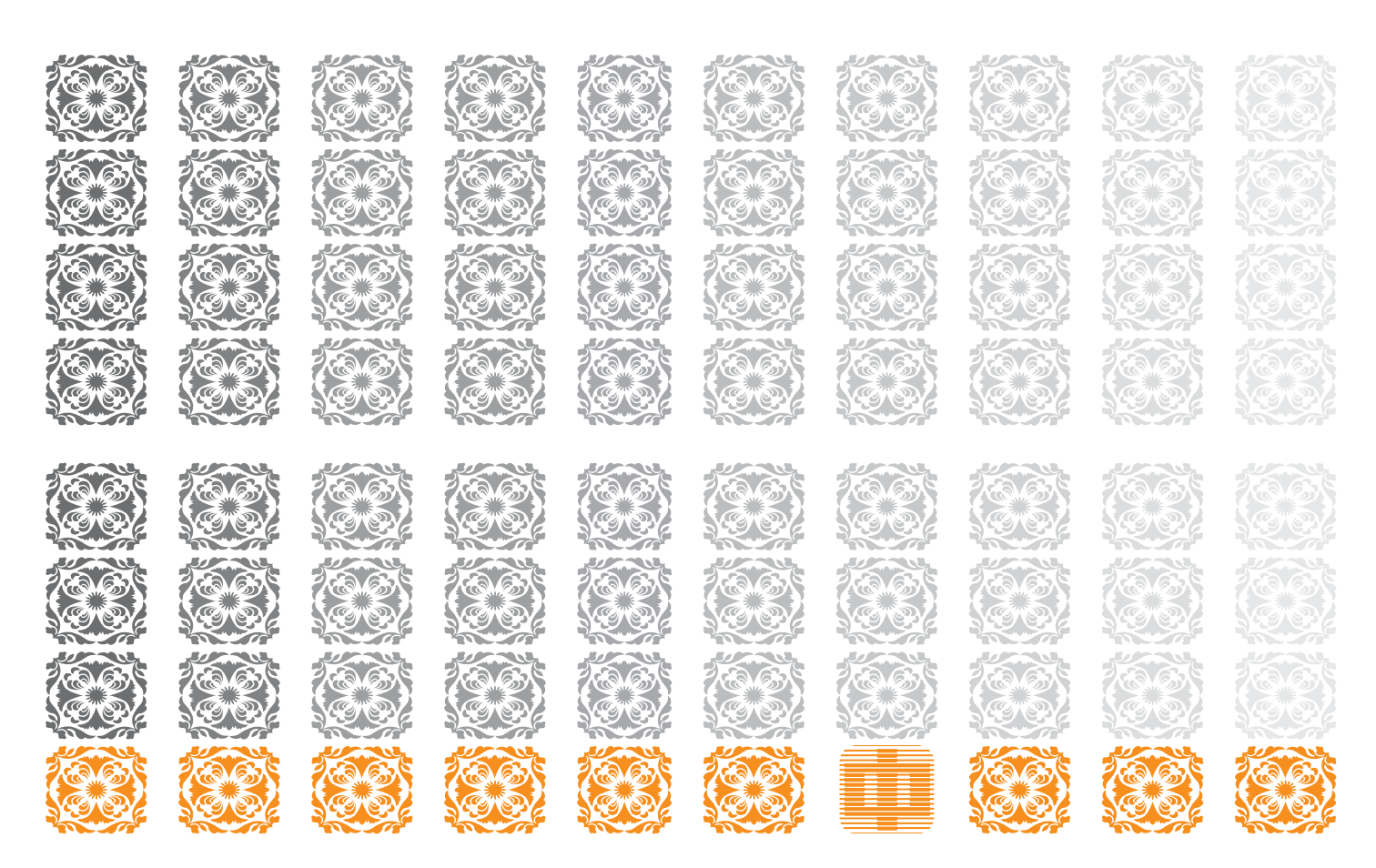
Champion Technology Holdings Limited