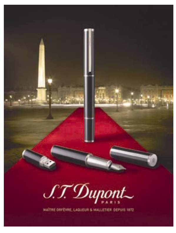
S.T. Dupont writing instruments. 「都彭」書寫文具。