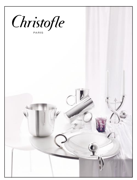
Christofle tableware. 「Christofle」餐具。