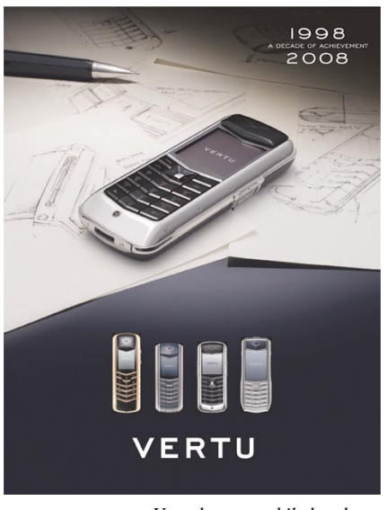
Vertu luxury mobile handsets. 「Vertu」名貴流動電話手機。

The Group considers China to be the market with the biggest growth potential, and intends to aggressively expand there through the opening of over 30 new shops during the current financial year and the introduction of new brands and merchandise.