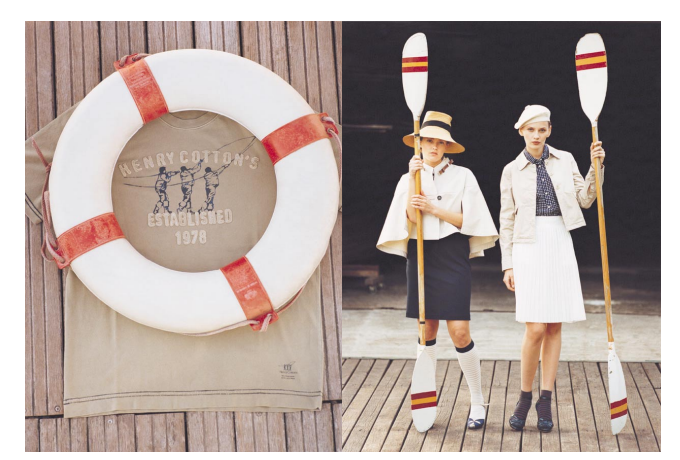
Henry Cotton's fashion. 「Henry Cotton's」時裝。