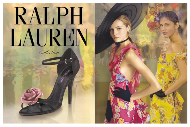
Ralph Lauren Collection. 「Ralph Lauren Collection」系列。