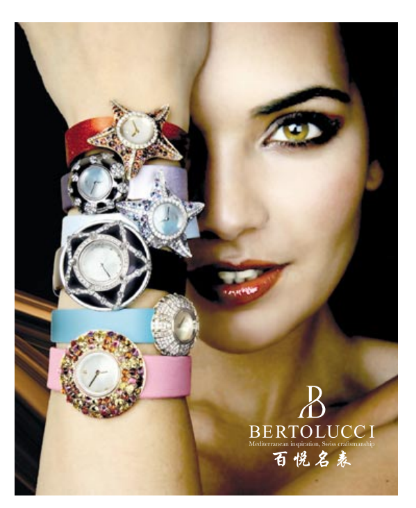
Latest watch collections by Bertolucci. 「百悦名表」的最新腕錶系列。