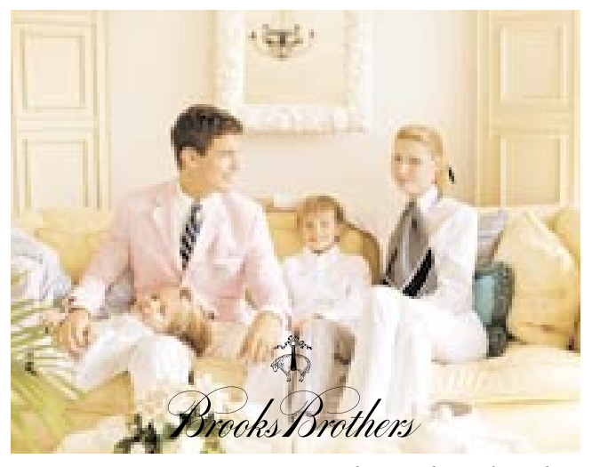
Fashionwear by Brooks Brothers. 「Brooks Brothers」時裝。