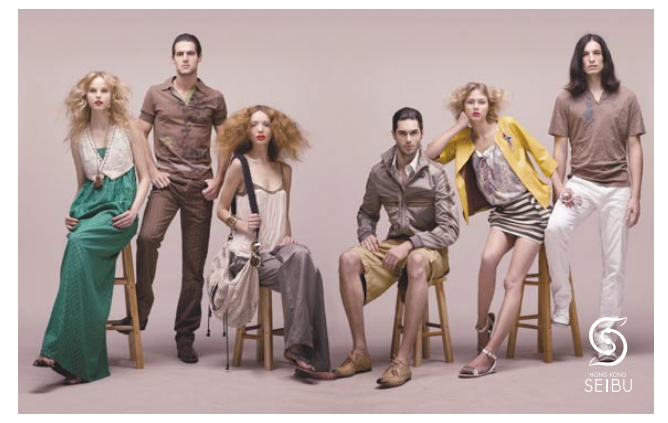
Spring/Summer 2008 fashion at Hong Kong Seibu. 於「香港西武」的二零零八年春/夏季時裝。

As Hong Kong's economy continues to grow, the Group is extremely confident that Hong Kong will remain one of the Group's key profit centres.