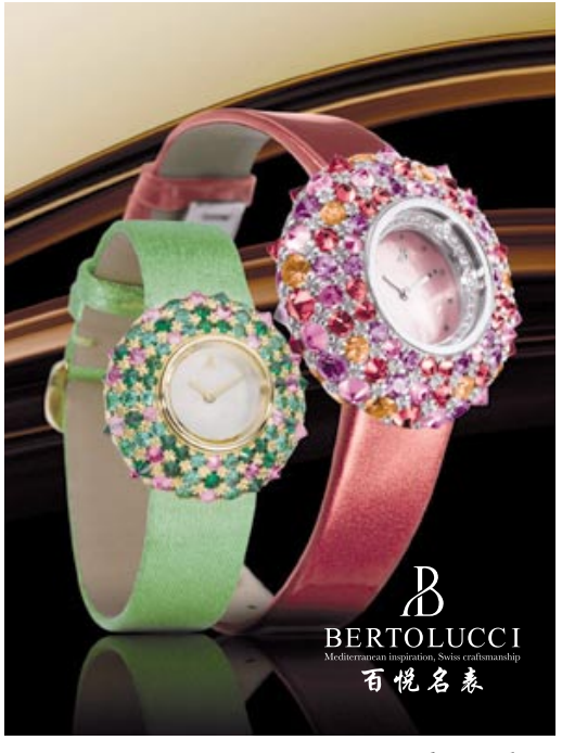
Luxury timepieces by Bertolucci. 「百悦名表」名貴腕錶。

Following the successful launch of the two new watch collections since its acquisition by the Group, Bertolucci was invited to relocate its pavilion and present its products at this year's Baselworld Trade Fair in the hall reserved for the world's most prestigious watch brands. This enabled Bertolucci to significantly enhance its international prestige in the eyes of all the world's leading watch retailers. It is envisaged that as its reputation is further enhanced, Bertolucci will become a meaningful asset for the Group in the longer term.