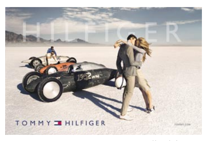
Tommy Hilfiger fashionwear. 「Tommy Hilfiger」時裝。