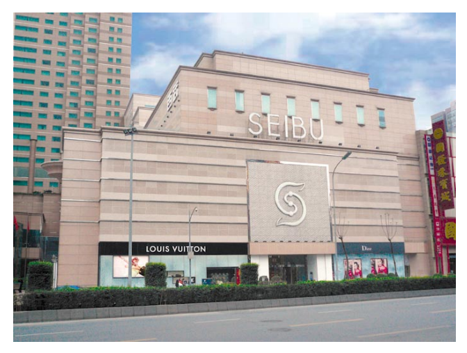
The Seibu store in Chengdu, Sichuan Province, China. 位於中國四川省成都市的「西武」店。