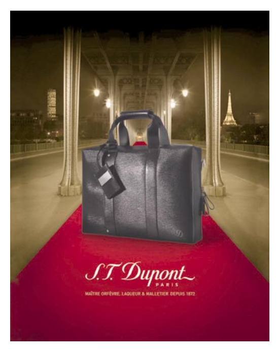
S.T. Dupont leathergoods. 「都彭」皮具。