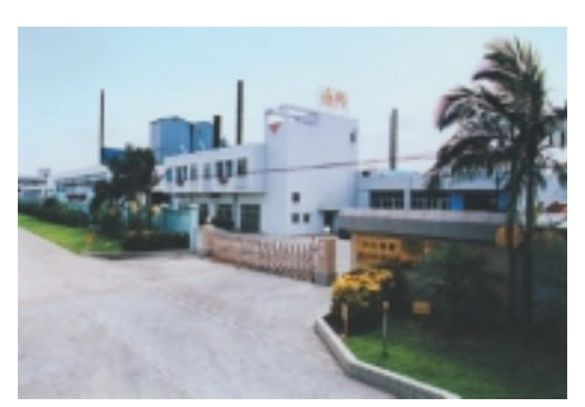
Front View of the Industrial Laminate Plant in Zhongshan, the PRC

The continuing unfavourable operating environment, especially the surge of raw material costs, appreciation of RMB and tightening of administrative controls in Mainland China has cast significant doubts on the future operation of the manufacturing industry in Mainland China. The Group has experienced heavy margin squeezing in the past year in the laminate division. Weak operating results also exerted considerable pressure on the Group's cashflow position. The Group will implement a series of measures to ease the cashflow. Such measures may include the restructuring of certain business units and disposal of non-