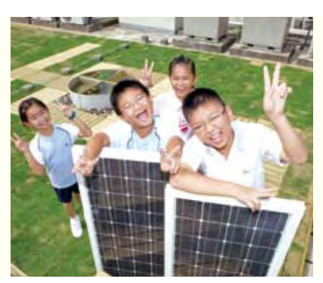
The Clean Energy Fund supports the use of renewable energy on school campus.

Students gain practical insights and learn about applications of renewable energy for sustainable development with the support of the HK Electric Clean Energy Fund.