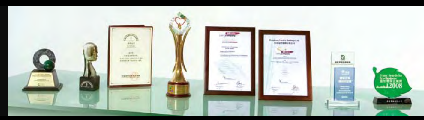
2008 HK Award for Industries; 8th China Golden Awards for Excellence in Public Relations; Gold Award in The HK Federation of Insurers Award for Excellence in Occupational Safety & Health; U3A programme named Outstanding Partnership Project; Caring Company Logo; 2008 HK Enterprise Environmental Achievement Award; 2008 Prime Awards for Eco-Business.