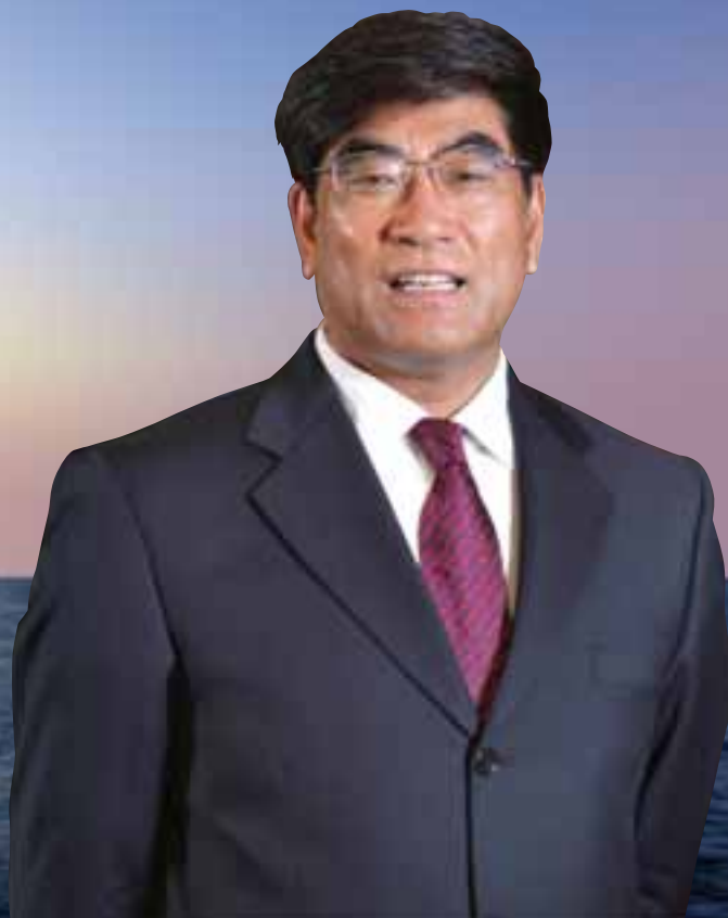
Fu Chengyu Chairman and Chief Executive Officer

By the time you read this report, the spirit of spring is prevailing both in China – one of the countries where our primary operation is located – and Hong Kong – one of the cities in which the Company is listed. However, marks of severe winter are still evident in the market. Along with optimistic forecast and prediction from some specialists, a wave of optimism looms over the hearts and ears of people. Yet skepticism, worries and negative sentiments continue to spread.