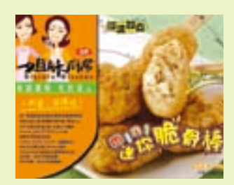
Traceable Processed Food