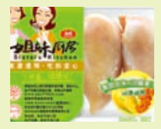
Traceable Fresh Meat