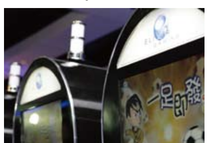
Focus on slot machine participation business

Melco China Resorts (Holding) Limited – a TSXV-listed company trading symbol "MCG"