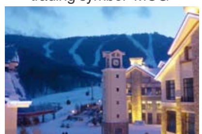
Focus on China ski resort market

Melco China Resorts (Holding) Limited – a TSXV-listed company trading symbol "MCG"