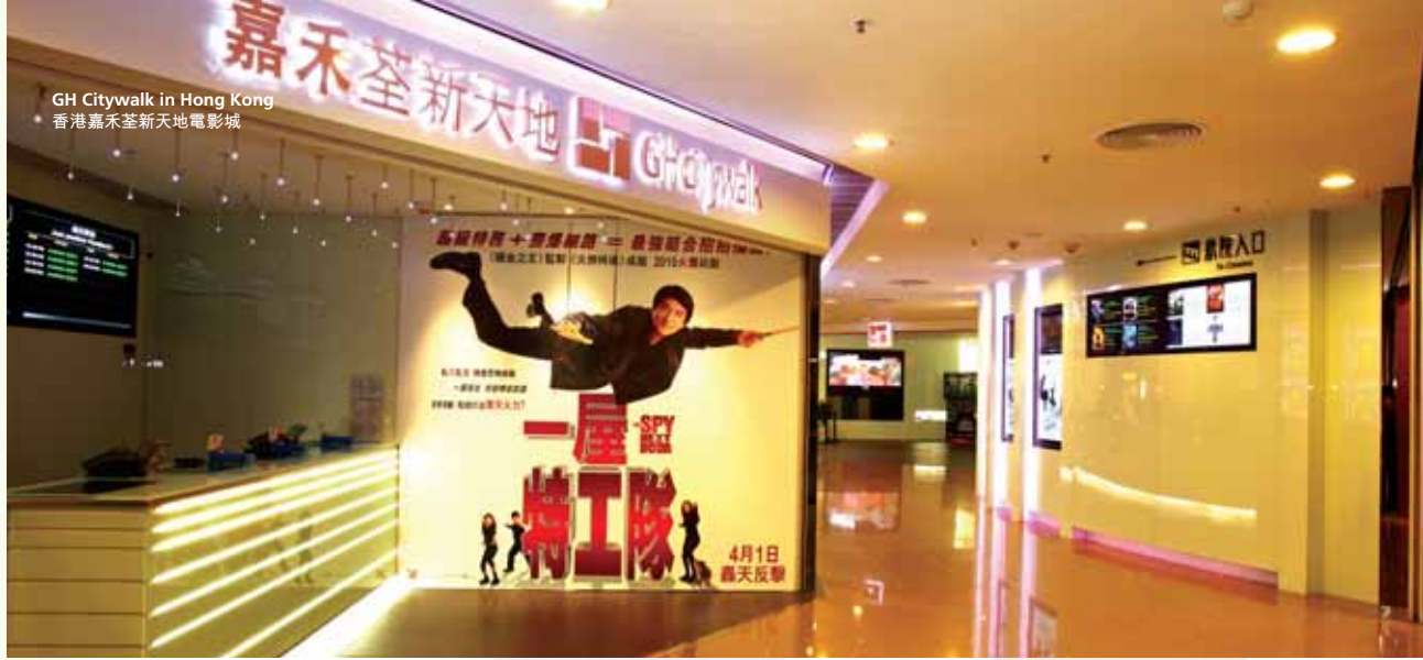
GH Citywalk in Hong Kong 香港嘉禾荃新天地電影城

The 2008/2009 financial period was a fruitful period for the Group in building a solid platform for exponential growth ahead, in particular, in Mainland China. The Group has strengthened business development and M&A effort to forge ahead in the nascent film industry in Mainland China, and plans to operate over 600 screens nationwide by 2012, thus becoming one of the leading exhibitors in Mainland China. During the 2008/2009 financial period, the Group completed the expansion of the GH-MIXC cinema in Shenzhen in October 2009 to a 12-plex from a 7-plex. The Group also opened a new 9-plex in Suzhou, namely GH Suzhou, in December 2009. In addition, the Group entered into agreement to acquire an exhibitor, which has two cinemas in operation and holds several lease agreements for new cinemas operation, during the 2008/2009 financial period.