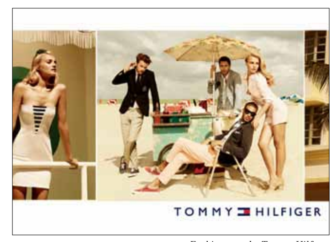
Fashionwear by Tommy Hilfiger. 「Tommy Hilfiger」時裝。