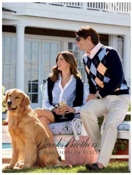
Fashionwear by Brooks Brothers. 「Brooks Brothers」時裝。