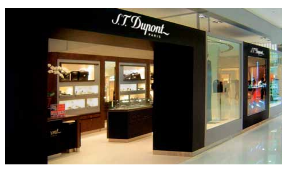
S.T. Dupont boutique at Star Place, Kaoshiung, Taiwan. 位於台灣高雄市大立精品館 的「都彭」精品店。

Tommy Hilfiger boutique at Raffles City Shopping Centre, Singapore. 位於新加坡萊佛士城購物中心 的「Tommy Hilfiger」精品店。