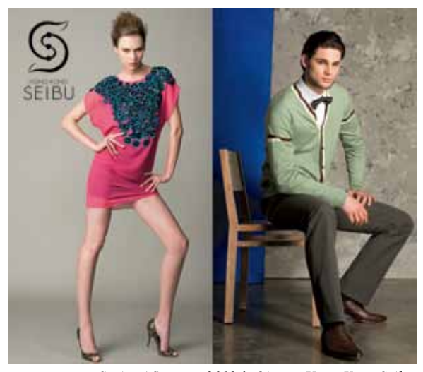
Spring / Summer 2010 fashion at Hong Kong Seibu. 於「香港西武」的二零一零年春/夏季時裝。

I would like to take this opportunity to thank my fellow Directors and all the Group's employees for all their hardwork and commitment during the year. Without their dedication and enthusiasm, we would not be able to overcome the challenges we face and achieve continued future success.