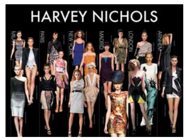
Ladies fashion at Harvey Nichols. 於「夏菲尼高」的女士時裝。