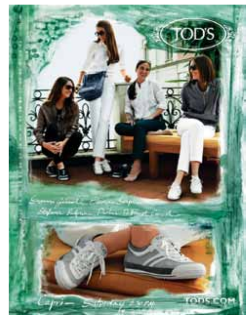
Tod's shoes and leathergoods. 「Tod's」皮鞋及皮具。

The Group is confident that its comprehensive retail network throughout China and the region, together with its net cash position of over HK$990 million and strong balance sheet, will enable the Group to exploit any economic recovery and take advantage of any investment opportunities of exceptional value.