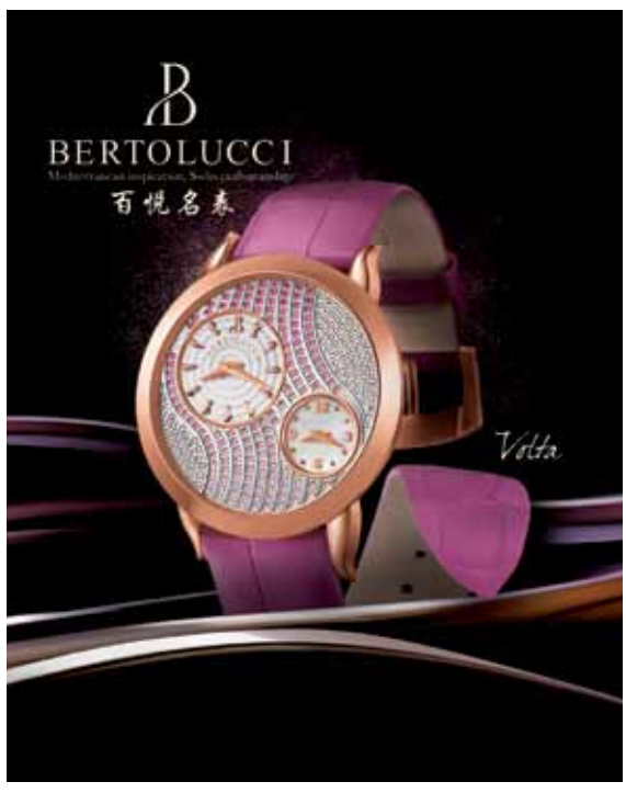
Bertolucci 'Volta' watch. 「百悦名表」的「Volta」腕錶。