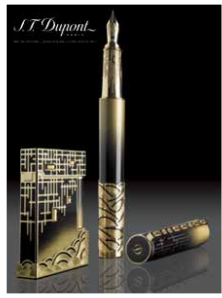
S.T. Dupont SHANGHAI Limited Edition Collection. 「都彭」的「上海」限量版系列。

The final dividend and special dividend together with the interim dividend of 13.0 cents per ordinary share amounts to a total dividend of 49.0 cents per ordinary share, an increase of 69.0 per cent. compared with 29.0 cents per ordinary share paid out last year.