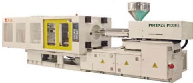
The Group’s 320-tonne servo-driven energy-saving plastic injection moulding machine

During the year, the Group made good achievement in the R&D of plastic injection moulding machines. In respect of servo-driven energy-saving plastic injection moulding machines, after authoritative inspection and testing by the Chinese National Plastic Machinery Products Quality Supervision and Inspection Centre, the servo-driven energy-saving high precision plastic injection moulding machines developed by the Group attained Grade 1 in the energy efficiency standard set out by the State, and gained a leading position among counterparts in the industry. On the basis of the “EFFORT” series of direct-clamp plastic injection moulding machines which were successfully launched, the Group has already developed the advance-performance second generation direct-clamp plastic injection moulding machines and is launching them in the market. In respect of large-scaled plastic injection moulding machines, the Group successfully developed the “FORZA” new series of large tonnage two-platen plastic injection moulding machines, and have also developed large tonnage plastic injection moulding machines with a clamping force of 3000 tonnes. This was not only an important breakthrough in the R&D of the Group, but also played a key role in expanding the scope of plastic injection moulding machines product profile, in meeting customer demands and in accelerating the development of the Group’s plastic injection moulding machine business.