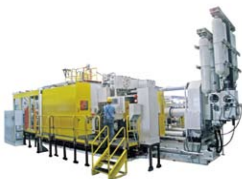
The Group's 3000-tonne large tonnage cold chamber die-casting machine supplied to a renowned customer in the USA

As a result of the financial crisis, new orders for large die-casting machines were sluggish, and the delivery of existing orders were postponed, only small die-casting machines gained a growth in the unfavourable environment during the first half of the year. However, during the second half of the year, delivery of the postponed orders resumed gradually, and new orders also increased rapidly. The growth momentum in the die-casting machine market in the PRC, in particular, was encouraging. The turnover of the Group's die-casting machines products from the PRC market for the year increased by more than 65% over last year.