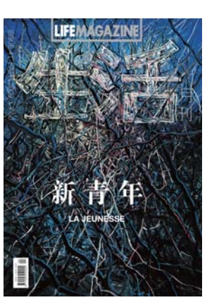
生活月刊 2010年獲亞洲出版人協會頒發 "Magazine Design"