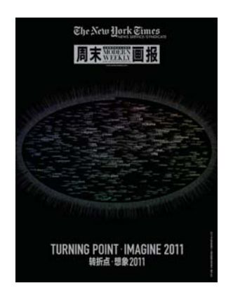
TURNING POINT. IMAGINE 2011