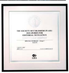
Life Magazine "Special Coverage" by SOPA, 2010