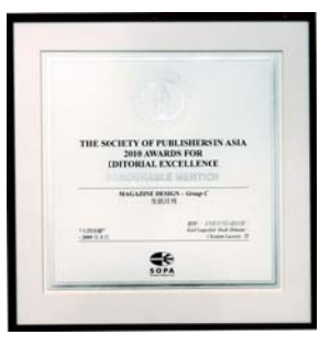
Life Magazine "Magazine Design" by SOPA, 2010