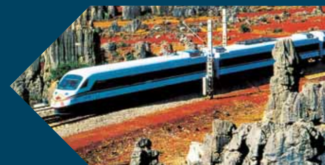
Railway Construction Completed a total track laying length of railway main lane of 7,901 kilometers in 2010