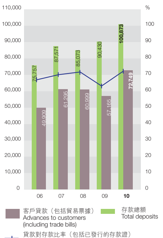
客戶貸款 / 存款總額 Advances to customers / Total deposits 百萬港元 HK$ Million

貸款對存款比率(包括已發行的存款證) Loan to deposit ratio (including certificates of deposit issued)