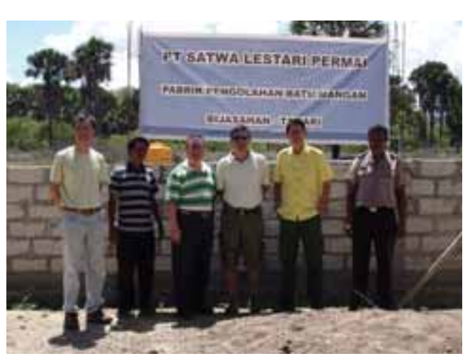
The scene of the Manganese Ore Processing Centre in Kupang Island, Indonesia

The Group operates its securities and financial operation through its wholly owned subsidiaries, namely Interchina Securities Limited and Interchina Finance (H.K.) Limited. This operation provides stable brokerage commission income and interest income to the Group at all time. Given the increasingly fierce competition in securities and financial market, the Group intends to enhance its competitiveness in securities and financial operation by merger and acquisition with a view to further extend the size of this operation.