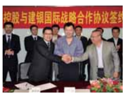
The signing of an agreement with CCB International in Beijing

In 2001, policies and market competition have been constantly changing. Document No. 1 promulgated by the Central Government focus on water resources issues, aiming at water resources development. When the Twelve Five-year Plan was rolled out, the environmental protection industry topped the list among the seven new strategic industries, ushering unprecedented development opportunities to the industry. At the right time, Heilongjiang Interchina also completed a new share issue in an amount of RMB750 million.