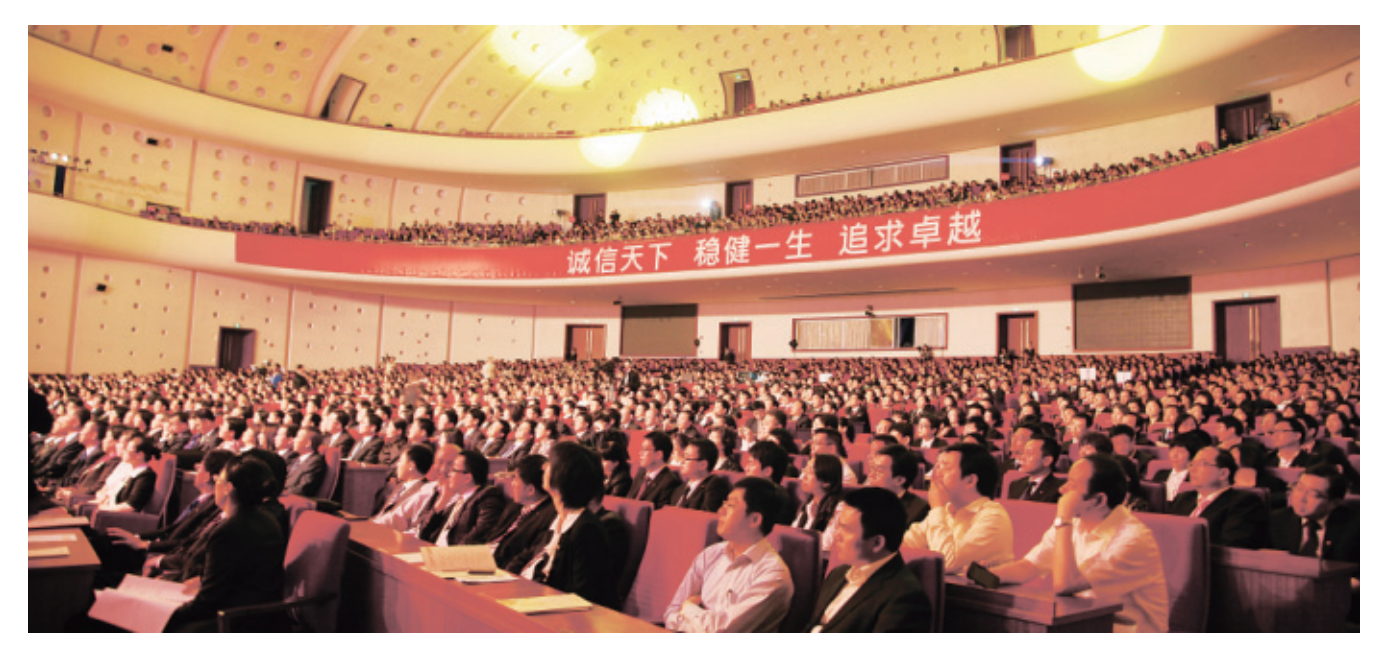
CPIC holding its 20th anniversary celebration ceremony on 13 May 2011

During the year, in the face of the ever-changing and complex domestic and international economic and financial conditions, CPIC persevered with its focus on developing main insurance businesses, promoting and implementing development strategies to achieve sustainable value-enhancing growth. By also proactively responding to market changes, the Group maintained healthy development of its overall businesses. The Group's gross written premiums in the first half of 2011 was RMB86.875 billion, representing an increase of 14.2% over the same period of the previous year. The Group benefited from its significantly improved ability to realize underwriting profit in property and casualty insurance and the rapidly growing profitability of life insurance, with the result that the net profit attributable to equity holders of the parent company was RMB5.816 billion in the first half of 2011, representing an increase of 44.7% over the same period of the previous year.