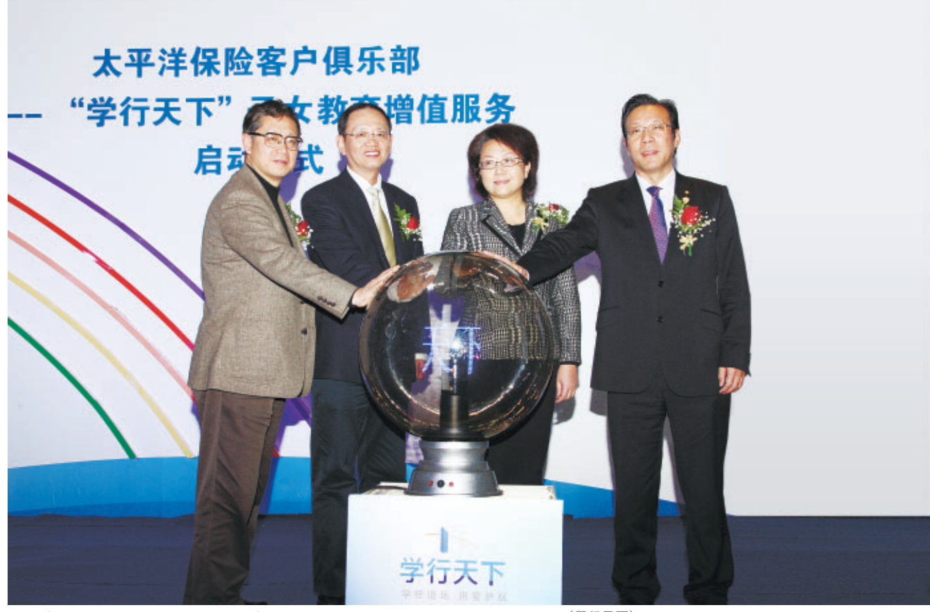
CPIC Life launched a value appreciation service for children education, "Harboring Knowledge in the World (學行天下)".