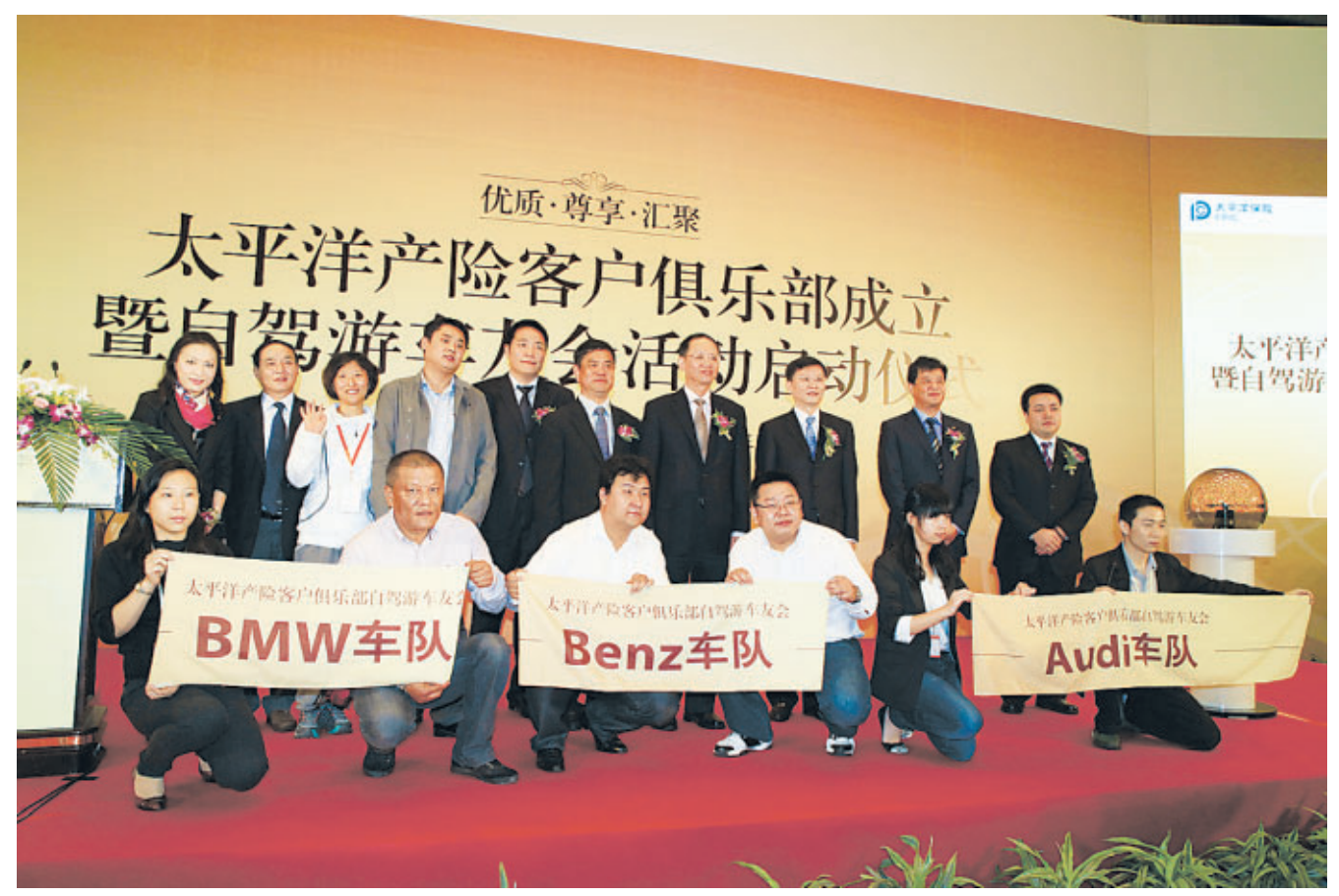
Opening ceremony of the customer club and driving tour club of CPIC Property