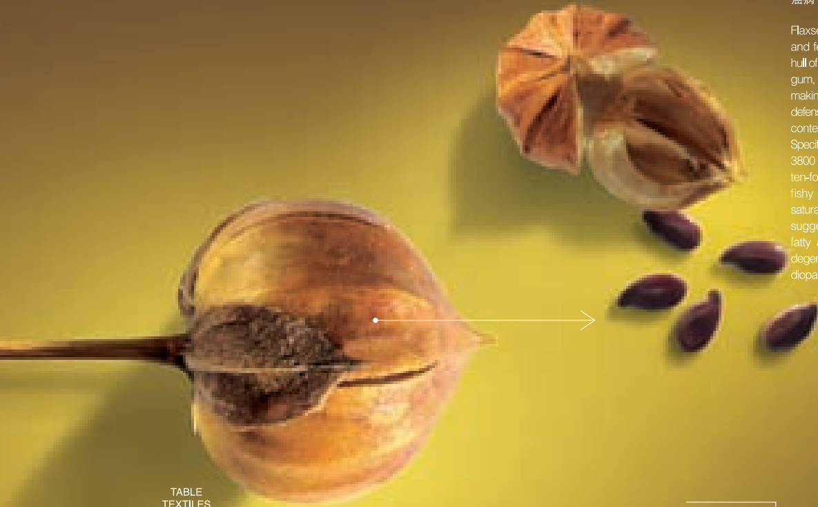
TABLE TEXTILES 成衣