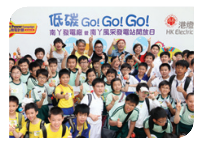
Smart Power Campaign promotes a low carbon lifestyle among youngsters.

The Smart Power Campaign, HK Electric's programme to promote energy conservation, continued to focus on promoting a low carbon lifestyle in 2011. Special electronic platforms such as mobile applications and a Facebook fans page were introduced to raise public awareness. The "HK Electric Low Carbon App" was launched for free downloads to provide a trendy and easy way to users to learn more about a low carbon lifestyle anytime, anywhere, attracting over 15,000 downloads during the year.