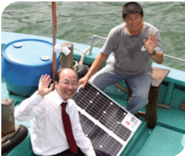
We sponsor the fishery sector to install photovoltaic panels on fishing boats and rafts to help reduce Hong Kong's carbon emissions.

Power Assets participated in the sixth Eco Expo Asia in October in Hong Kong to share our low carbon initiatives with about 500 local and overseas stakeholders, including government officers, buyers, environmental specialists, teachers and students.