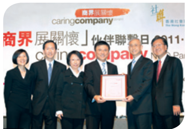
We are honoured to receive the "Total Caring Award" under the Caring Company Scheme by the Hong Kong Council of Social Service in April.

Under RepuTex's (the research partner of Hang Seng Corporate Sustainability Index) environmental, social and corporate governance ratings for China and Hong Kong, Power Assets was upgraded from "A" for 2010 to "A+" for 2011.