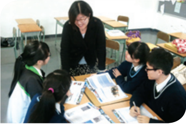
Teachers and students find the new reference book on energy very useful for the new liberal studies curriculum.