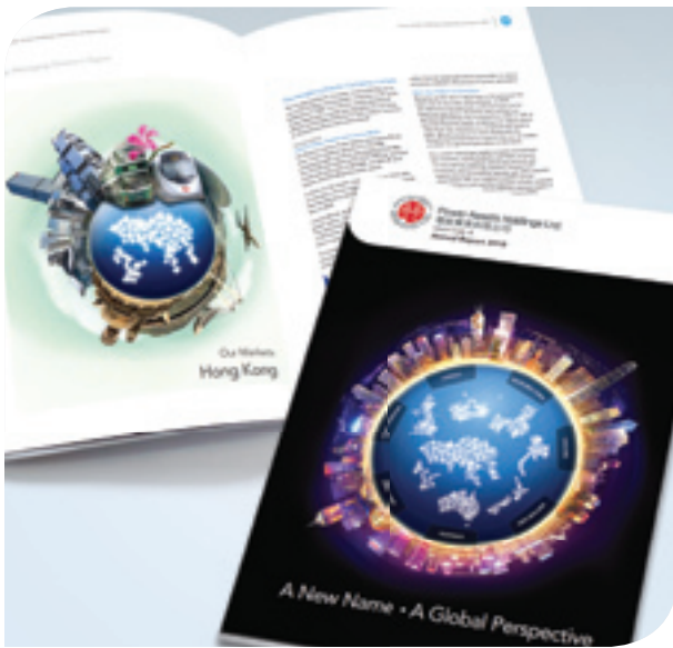
Our 2010 Annual Report wins two International ARC Awards.

Our website at www.powerassets.com is perhaps the most immediate way to access the latest information about the Company. We regularly upload notices, circulars, press releases, results announcements and other announcements onto our website. As well, our investors can access financial reports, company news and stock exchange filings on our website.