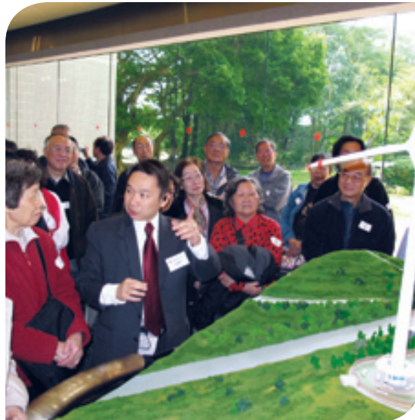
Our engineer explains to shareholders how Lamma Winds works.

openness and educate investors about the operations of the Company. To assist our shareholders in attending annual and extraordinary general meetings of the Company we provided a transportation guide and shuttle bus services. In Hong Kong we offer shareholders personalised tours of the Lamma Power Station. In 2011, more than 1,000 shareholders and their friends have visited our Lamma Power Station. As post-visit surveys revealed, shareholders found the visits highly interesting and useful.