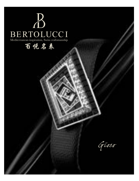
Bertolucci 'Gioco' watch. 「百悦名表」的「Gioco」腕錶。