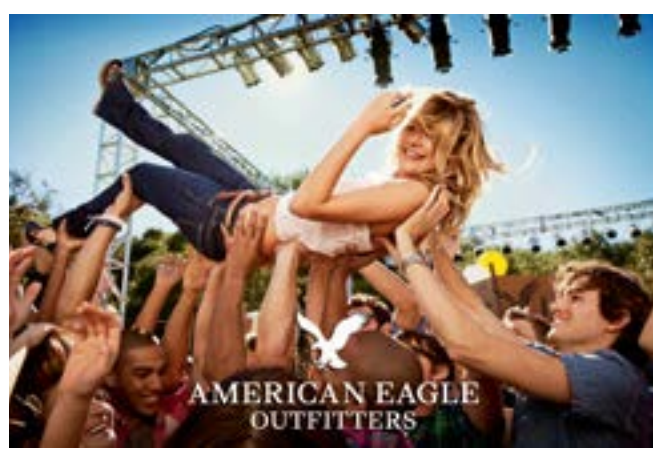
Fashionwear by American Eagle Outfitters. 「American Eagle Outfitters」時裝。