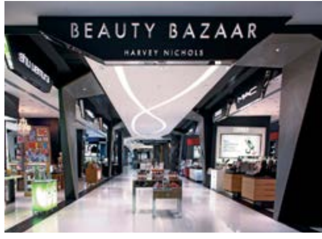
Beauty Bazaar by Harvey Nichols at The ONE, Tsimshatsui, Hong Kong. 位於香港尖沙咀「The ONE」的 「Harvey Nichols」之「Beauty Bazaar」店。

With its strong cash position of HK$862.9 million, and its strong recurrent income, the Group remains perfectly positioned to exploit and take advantage of any investment opportunities of exceptional value.