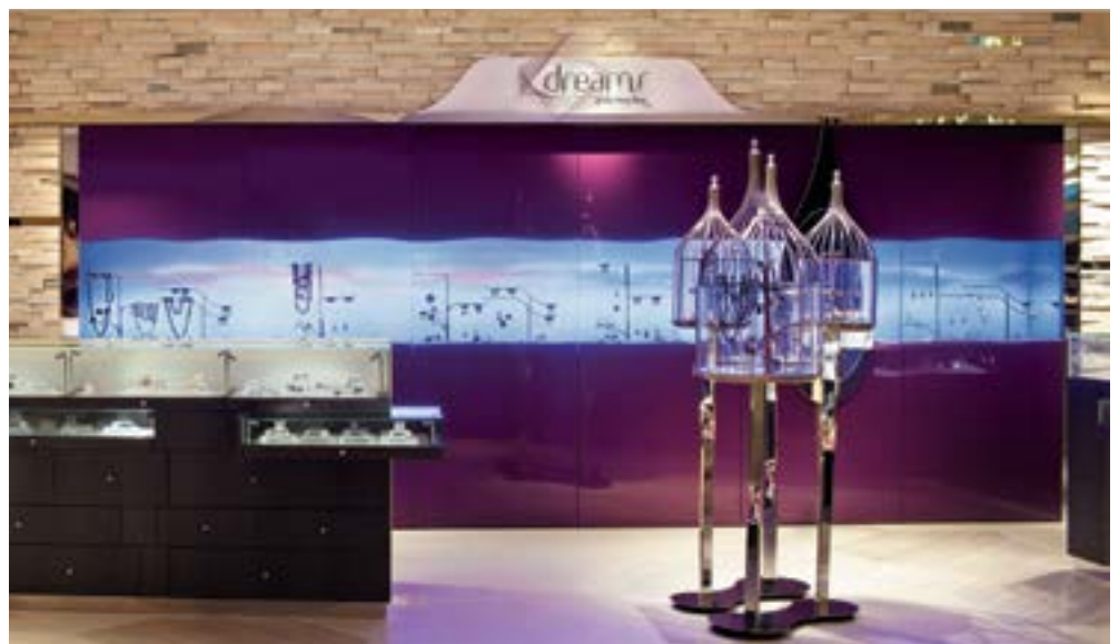
Dreams corner at Harvey Nichols store, Pacific Place, Hong Kong. 位於香港太古廣場「Harvey Nichols」 店內的「Dreams」專櫃。