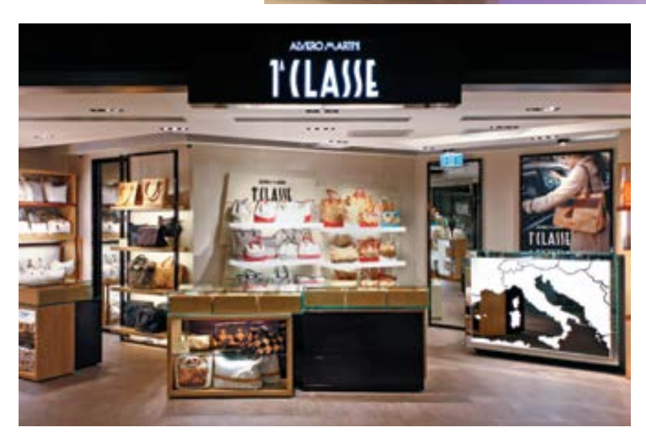
Alviero Martini I<sup>A</sup> Classe boutique at Langham Place, Mongkok, Hong Kong. 位於香港旺角朗豪坊的 「Alviero Martini I<sup>A</sup> Classe」精品店。