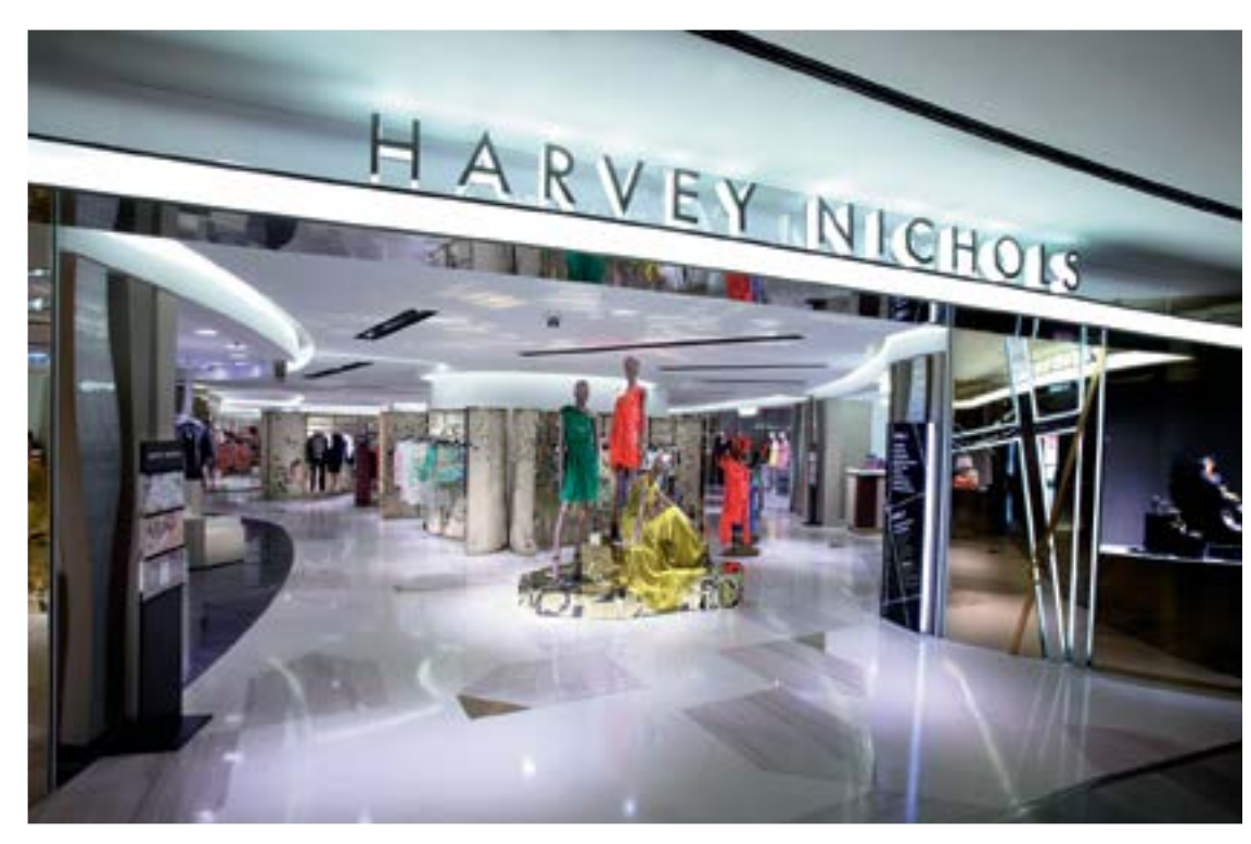
Harvey Nichols Asian flagship store at Pacific Place, Hong Kong. 位於香港太古廣場 的「Harvey Nichols」 亞洲旗艦店。