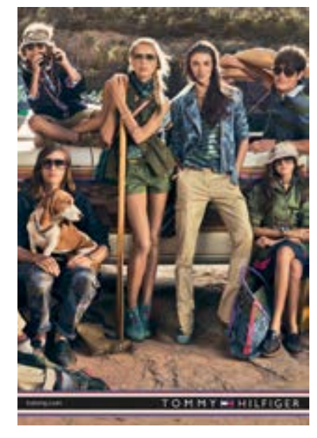
Fashionwear by Tommy Hilfiger. 「Tommy Hilfiger」時裝。