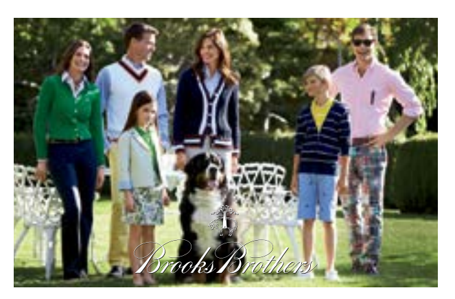
Fashionwear by Brooks Brothers. 「Brooks Brothers」 時裝。