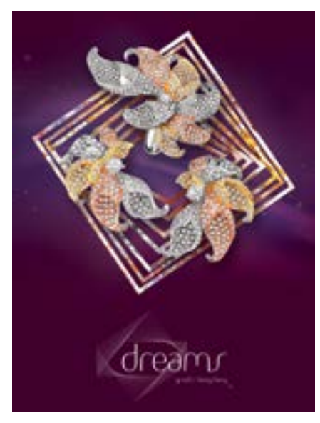
Dreams fashion jewellery. 「Dreams」時尚飾物。