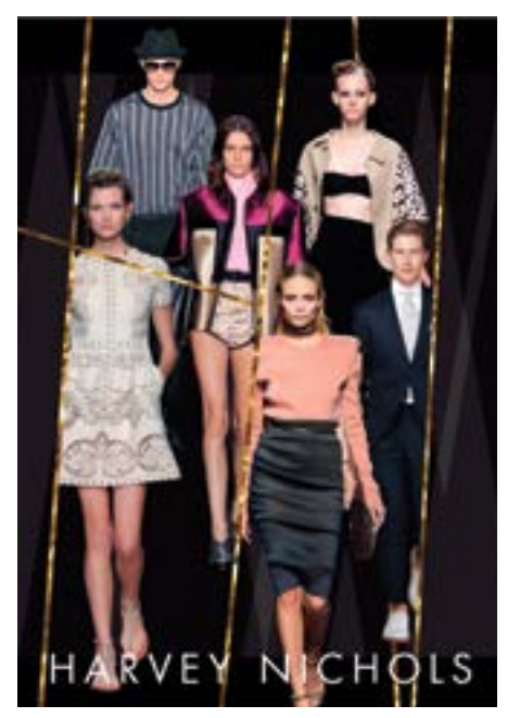
Fashionwear at Harvey Nichols. 於「Harvey Nichols」的時裝。

In Southeast Asia, the Group has 26 shops. Following the opening of flagship stores for Dickson Watch & Jewellery, Brooks Brothers and Tommy Hilfiger in Singapore, which enhanced the positioning of these brands in this regional market, the Group continues to look for opportunities to expand its presence in these territories.