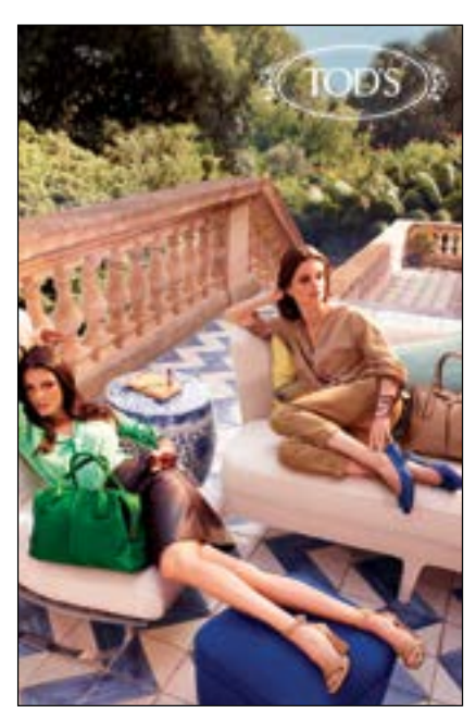
Tod's shoes and leathergoods. 「Tod's」皮鞋及皮具。