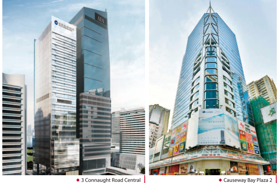
3 Connaught Road Central

As a result, our investment properties have performed well during the year under review. We will adopt a two-pronged strategy in delivering value in our investment portfolio as follows: