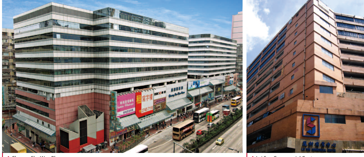
Cheung Sha Wan Plaza

The asset comprises of two 8-storey and 7-storey office towers erected on top of a retail podium which was completed in 1989. It is located on top of the Lai Chi Kok MTR station with a total GFA of approximately 690,006 square feet (excluding carparks). The arcade is positioned to serve the local communities nearby with major banks and recognised restaurants chains as the key tenants.