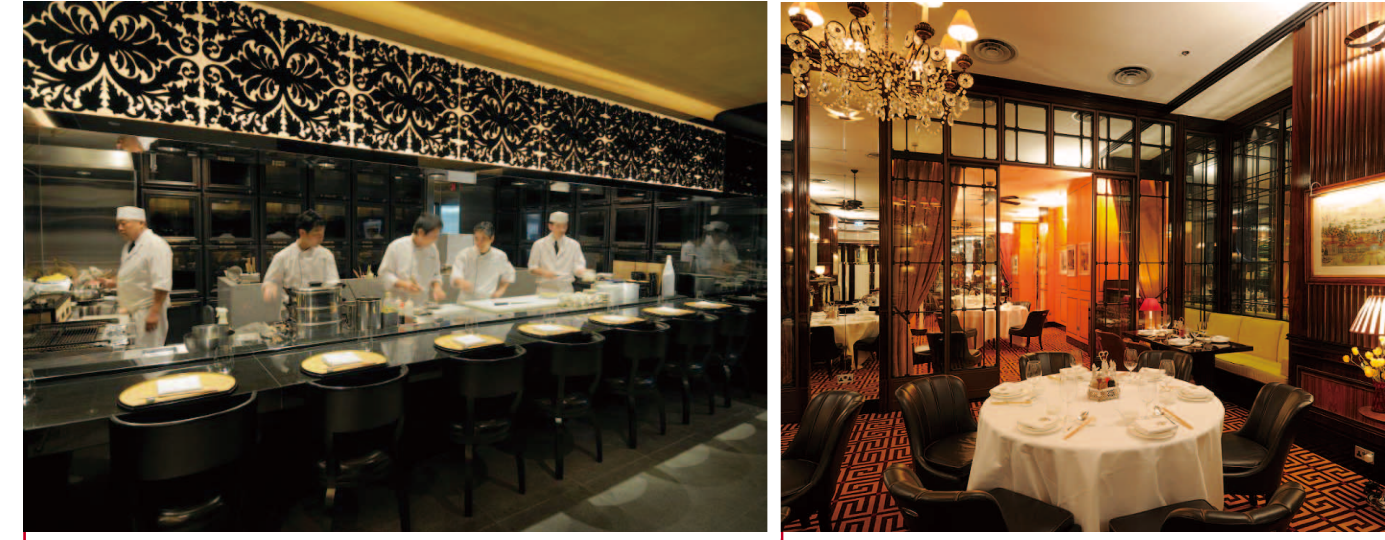
Wagyu Kaiseki Den in Hong Kong

The hotel and restaurant operations include the Group's interests in the historic Caravelle Hotel in Ho Chi Minh City, Vietnam and a number of acclaimed restaurants in Hong Kong including the only Michelin 3 star Italian restaurant 8½ Otto e Mezzo BOMBANA; Michelin 1 star Japanese restaurant Wagyu Kaiseki Den; Michelin 1 star Cantonese restaurant Island Tang; as well as other high profile restaurants such as Kowloon Tang and Chiu Tang.