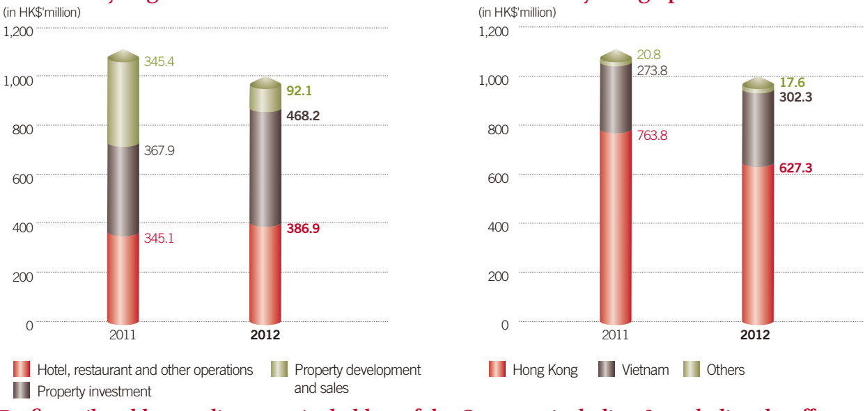
Turnover by Segment