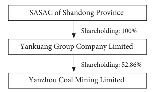
As at 31 December 2012, HKSCC Nominees Limited held 1,952,947,945 H Shares, representing 39.71% of the total share capital of the Company. HKSCC Nominees Limited is a participant of the Central Clearing and Settlement System and provides securities registrations and trustee services to its customers.

Diagram of equity and relationship of control between the Company and the actual controller: