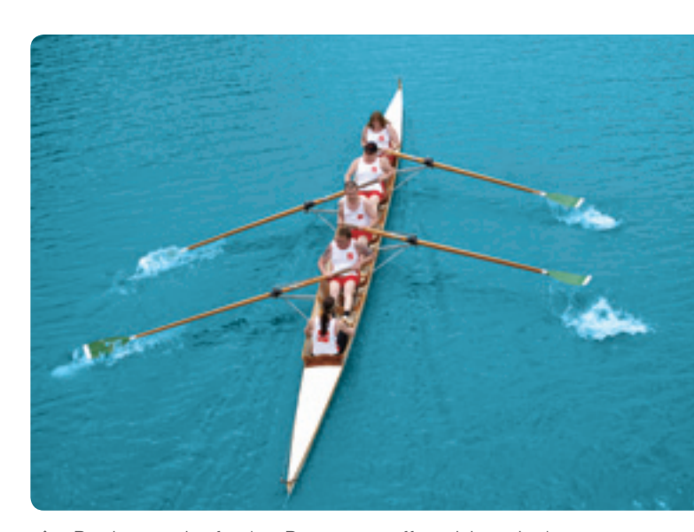
Rowing to raise funds – Powercor staff participate in the "Give Where You Live Geelong RiverFest".

In Thailand, Ratchaburi Power Company Limited (RPCL) continued to monitor noise, heat, lighting and ambient air quality to ensure a safe working environment for its 48 employees. RPCL achieved the OHSAS 18001-2007 accreditation in Safety Management, and its cumulative manhours without time lost due to accidents now exceed 1,170,000.