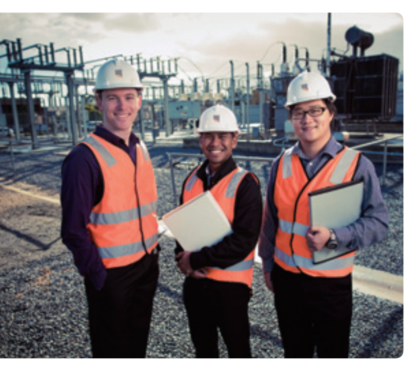
Helping graduates embark on engineering careers – young participants in SA Power Networks' training and apprenticeship scheme.

In Australia, SA Power Networks continued its nationally accredited training and apprenticeship scheme during the year, with 164 apprentices in training and 25 graduates participating in a three-year development programme.