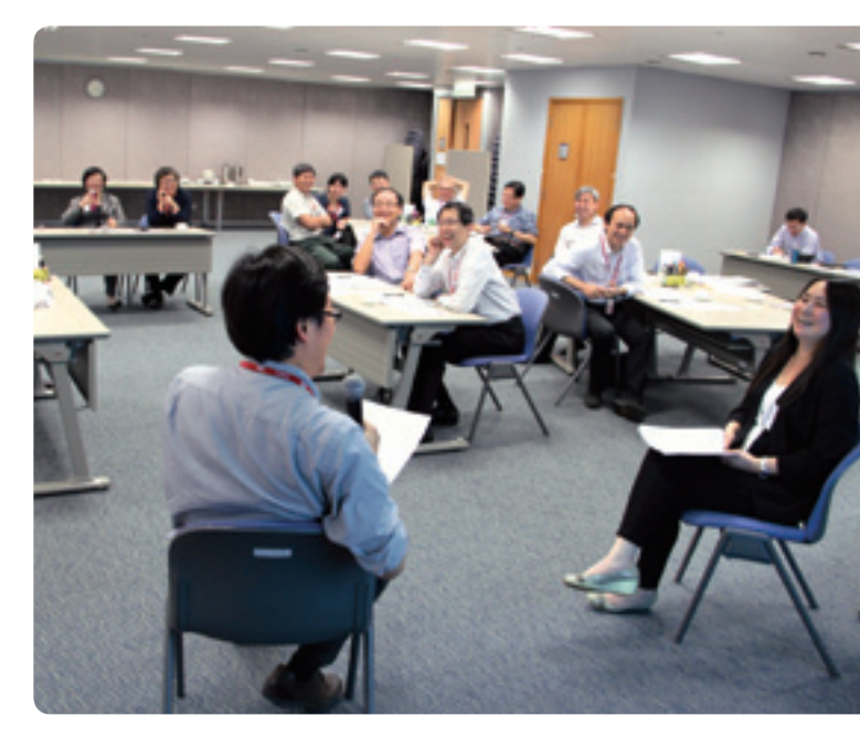
A light moment at one of the "Corporate Excellence Series" workshops, attended by about 240 managers.

We currently offer structured training programmes to around 50 to 70 young graduates.