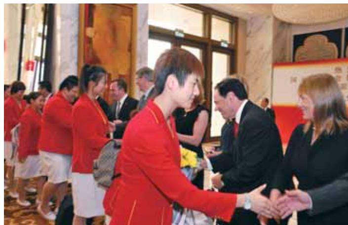
After the Beijing 2008 Olympic Games, GEG is once again given the great honor to provide warm hospitality to the Chinese London Olympics’ gold medalists throughout their stay in Macau