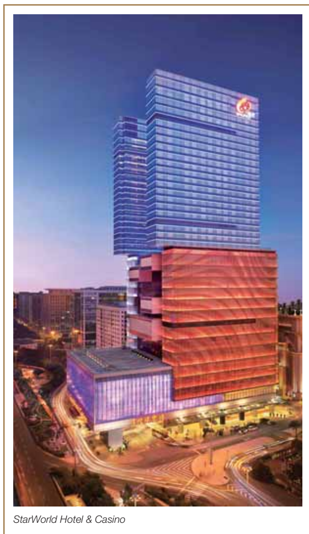
StarWorld Hotel & Casino

The demand for construction materials in Hong Kong continued to increase in 2012, which benefited the sales volumes of CMD's aggregates, ready-mixed concrete and asphalt operations, and contributed significantly to the Division's full year profits.