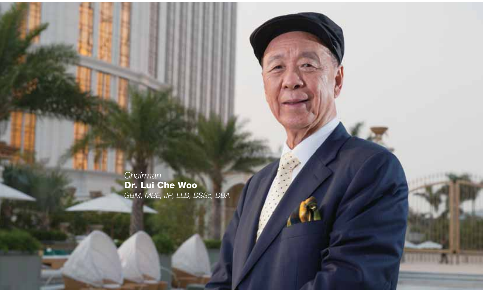
Chairman Dr. Lui Che Woo GBM, MBE, JP, LLD, DSSc, DBA