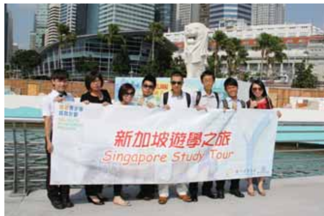
Final winners of “GEG Youth Achievement Program” received an opportunity to a Singapore Study Tour