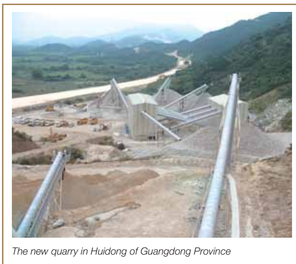
The new quarry in Huidong of Guangdong Province