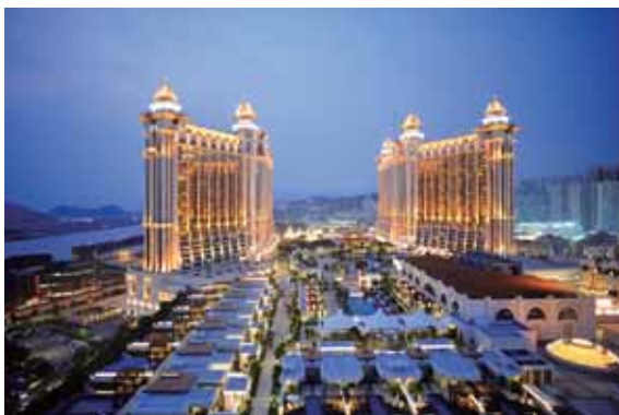
Galaxy Macau™ at night

Galaxy Macau™ has built an excellent reputation for providing customers with a unique, high quality Asia centric experience. In 2012 it received numerous accolades, including its new luxurious Sky Casinos being named Casino VIP Room of the Year at the prestigious International Gaming Awards, and the resort as a whole being awarded Best Resort Hotels by Travel & Leisure China and Best Integrated Resort of Asia by Asia Hotel Awards, among others.