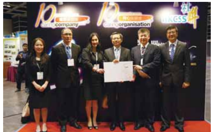
"10 Consecutive Years Caring Company Logo" awarded by Hong Kong Council of Social Service

CMD continued to embrace the Company's Sustainable Recycling Programme with the philosophy of "Support Green, Create Value from Waste" and recycled waste including waste glass, reclaimed asphalt pavement, concrete waste, rubber waste and oil waste generated from our daily operations. We organised a Tree Planting Day at the Huidong Quarry in Guangdong Province. We also supported the Caritas Computer Refurbish Project by donating old computers and computer accessories.