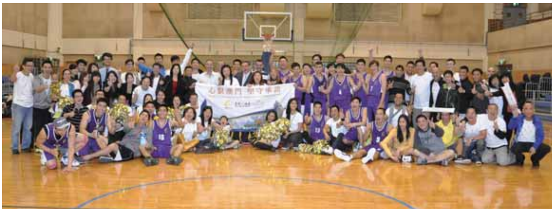
The GEG Basketball Team claimed Championship for the second time at the “6th Macau Gaming Industry Labourers Association Basketball Cup”