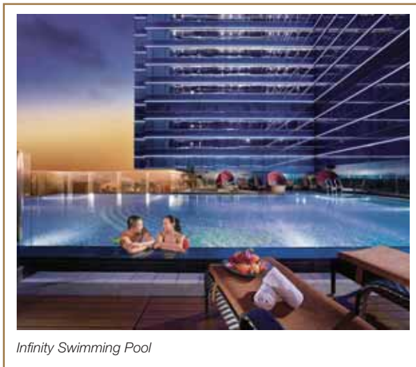
Infinity Swimming Pool

Since opening in 2006, StarWorld has garnered more than 30 awards from the industry. Its exemplary service standards and unique products were recognised once again in 2012, with the property receiving a whole host of awards including Annual Best Hotel Service of Asia by Asia Hotel Awards, CMN Most Popular Brand in Hong Kong & Macau by China Media Network, and Top Ten Influential Hotel of Asia and The Best Guest Experience Hotel of China from Asia Hotel Golden-Olive Awards.