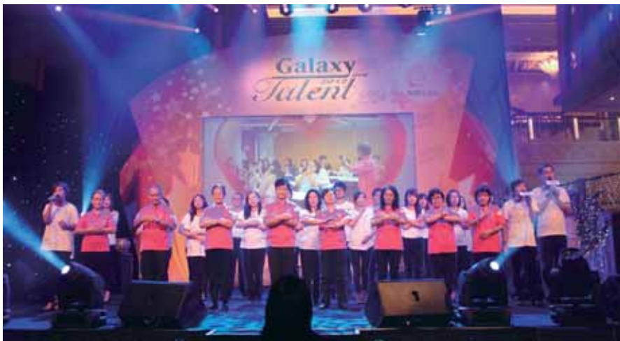
Members of Macau Deaf Association performed a song in sign language with the GEG volunteer team