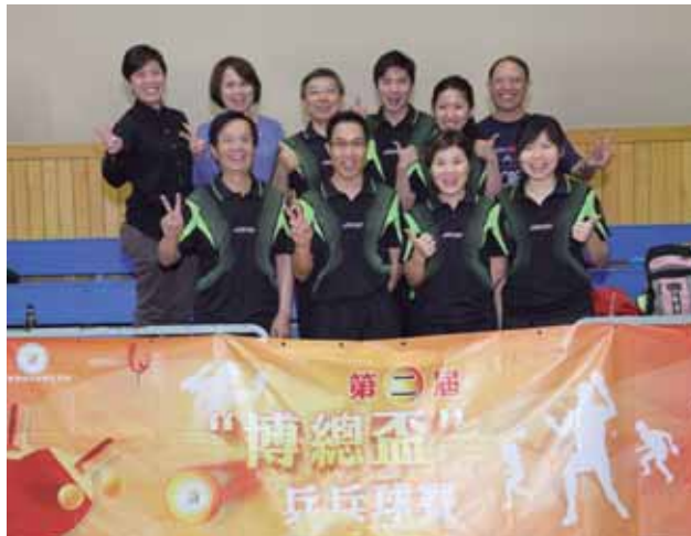
The GEG Table Tennis Team was crowned Champion in the “2nd Macau Gaming Industry Labourers Association Table Tennis Competition”