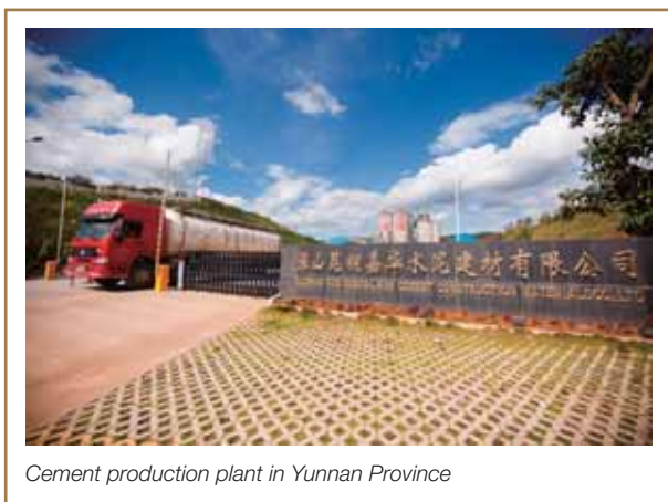
Cement production plant in Yunnan Province

Unlike other areas in Mainland China, market demand for cement in Yunnan Province remained strong. This is due to its geographical location and the Central Government's policy to accelerate the western region's economic growth through infrastructure construction and developing Yunnan Province into a bridgehead. CMD will continue to expand its cement production capacity in the Province given the promising outlook.