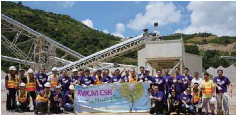
Huidong Quarry Tree Planting Day 2012

Corporate Social Responsibility is an integral part of the CMD's sustainable value, and CMD is committed to be a caring and responsible corporate citizen and continued to embrace our corporate philosophy "Contributing to our society where one benefits" by caring for our employees, the community and the environment.