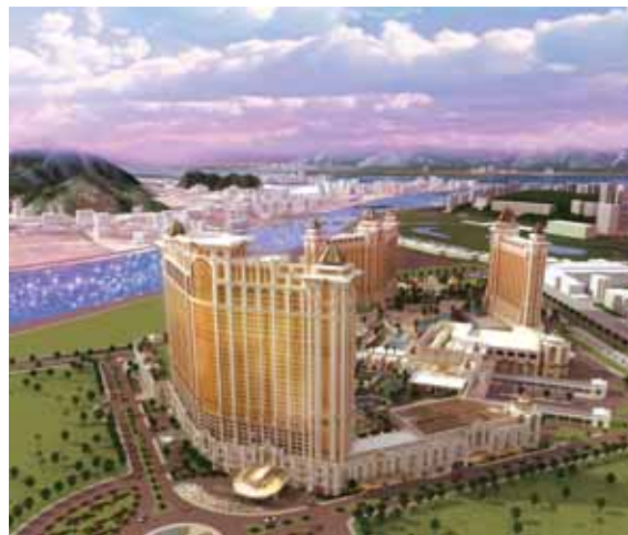
Galaxy Macau™ Phase 2 on schedule to complete in mid-2015

The planning for Phases 3 and 4 of the development is nearing conclusion. GEG intends to submit planning proposals to the government this year and targets to