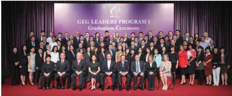
At the “GEG Leaders Program I Graduation Ceremony”