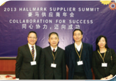
◆ 星光集團受邀參加2013年 Hallmark亞洲供應商年會 Starlite is invited to participate in the 2013 Hallmark Supplier Summit