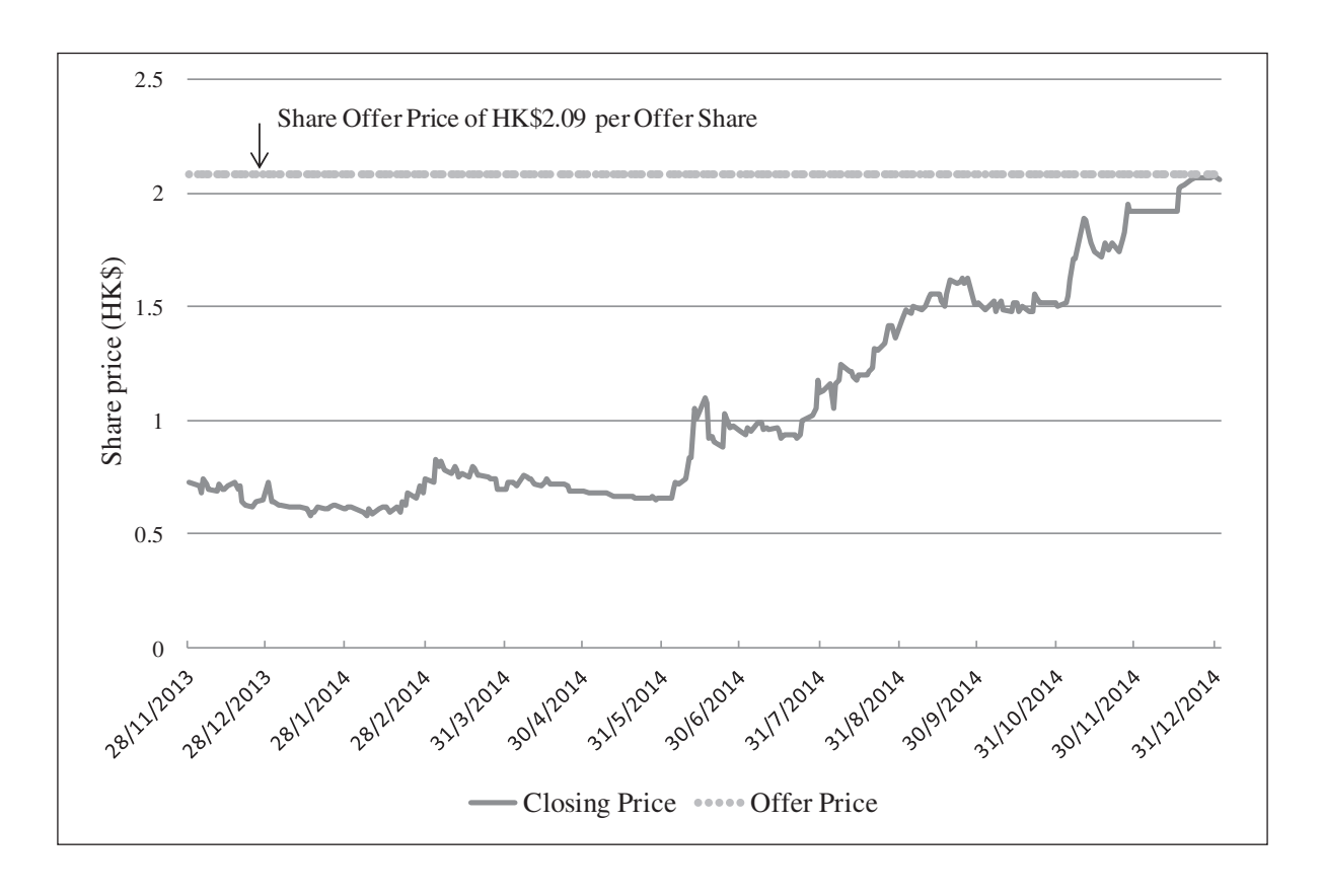
Chart 1: Share Offer Price versus the closing price of the Shares during the Review Period