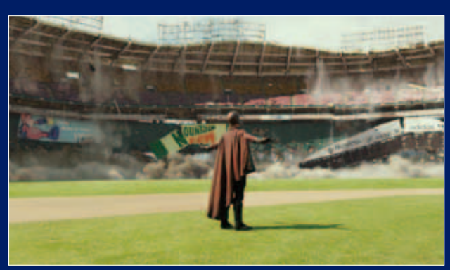
X-Men: Days of Future Past