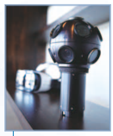
360 degree camera

Immersive is principally engaged in the business of interactive media technology including 360 captures, multi-camera stitching, dynamic streaming, digital live optimisation, multicamera and multi-input synchronisation, digital transmission and observation, multi-channel, capturing multi-panoramic views, camera to image identification, internal GPS to capture data capturing.